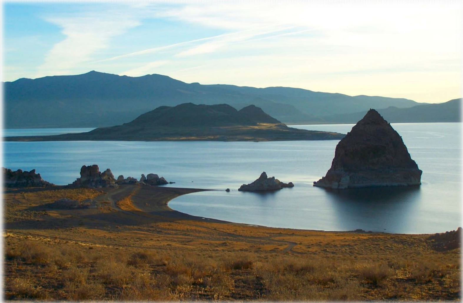
Pyramid Lake, Pyramid Lake Paiute Tribe