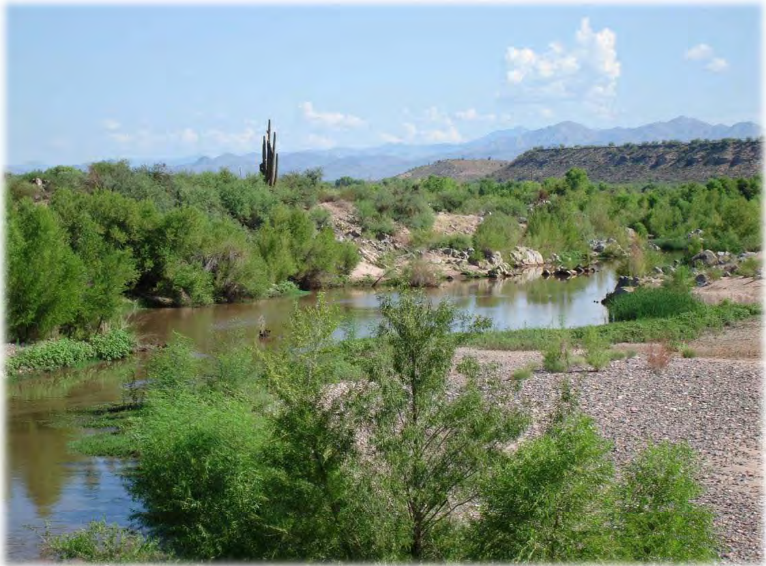
Verde River, Salt River Pima-Maricopa Indian Community