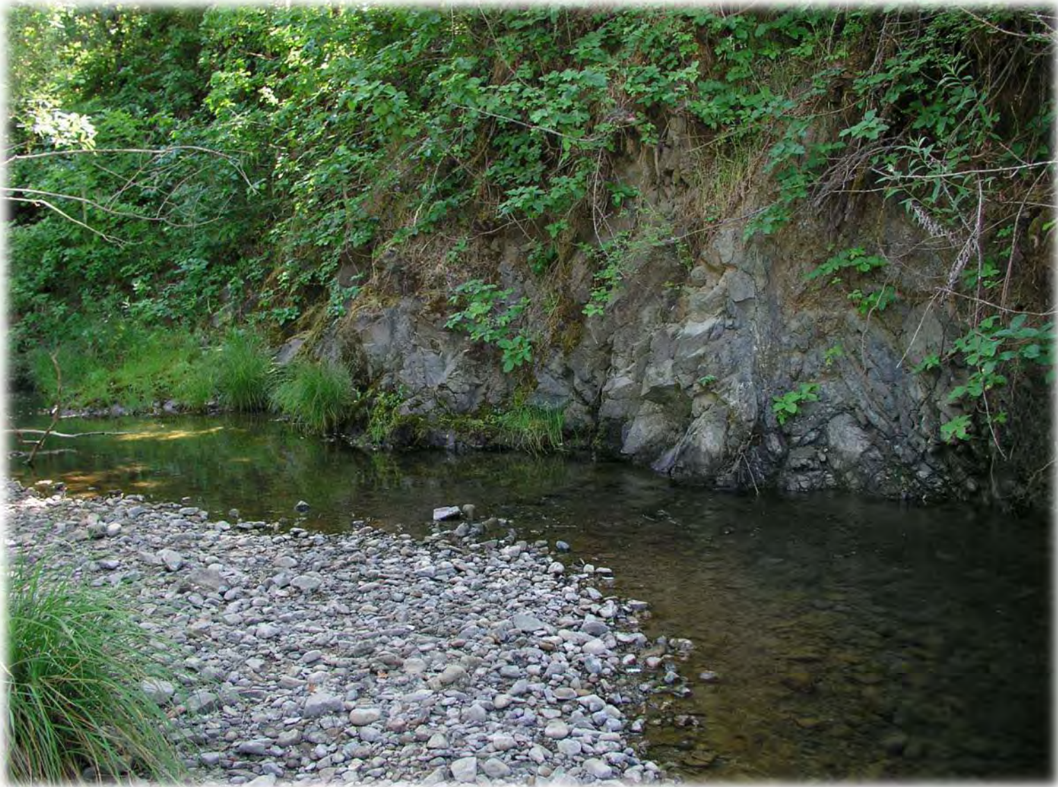
Nissah Kah Creek, Hopland Tribe