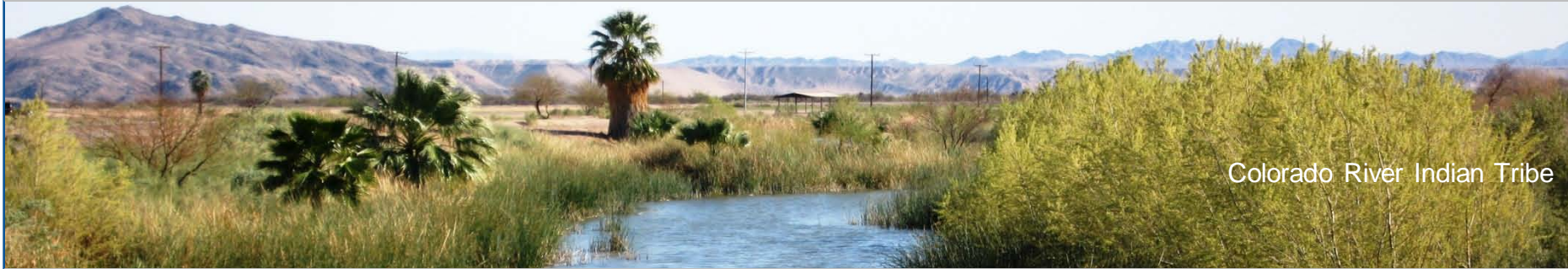
Colorado River Indian Tribe