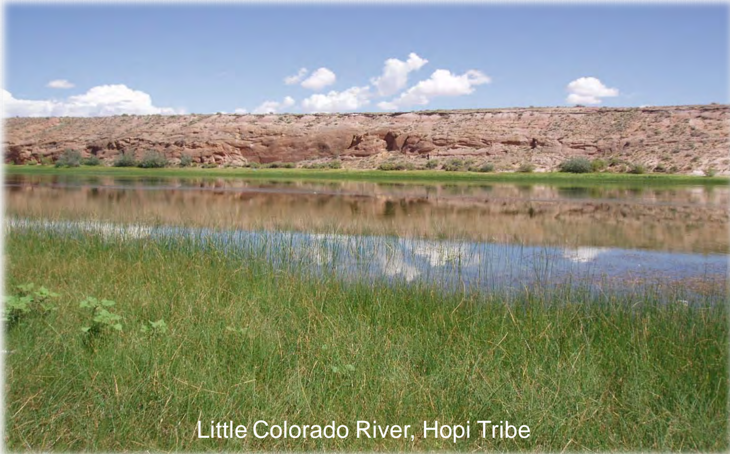
Little Colorado River, Hopi Tribe