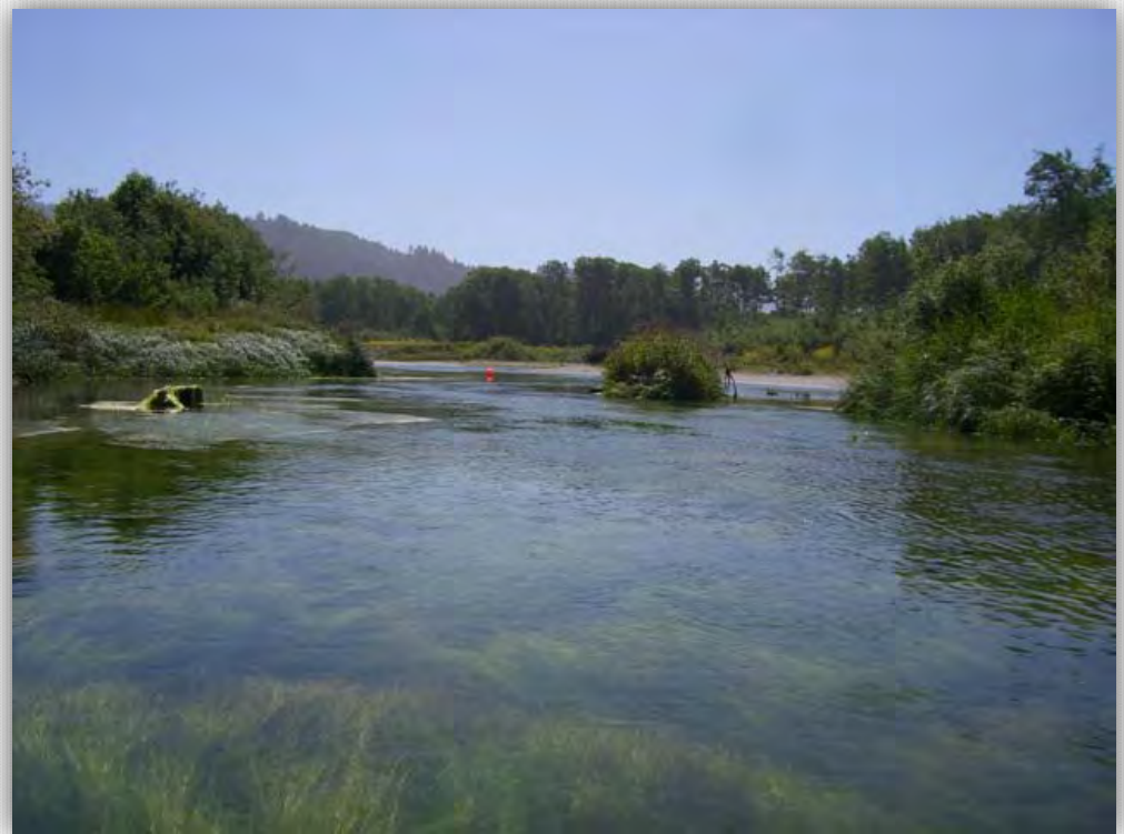
Yurok Tribe, Northern CA