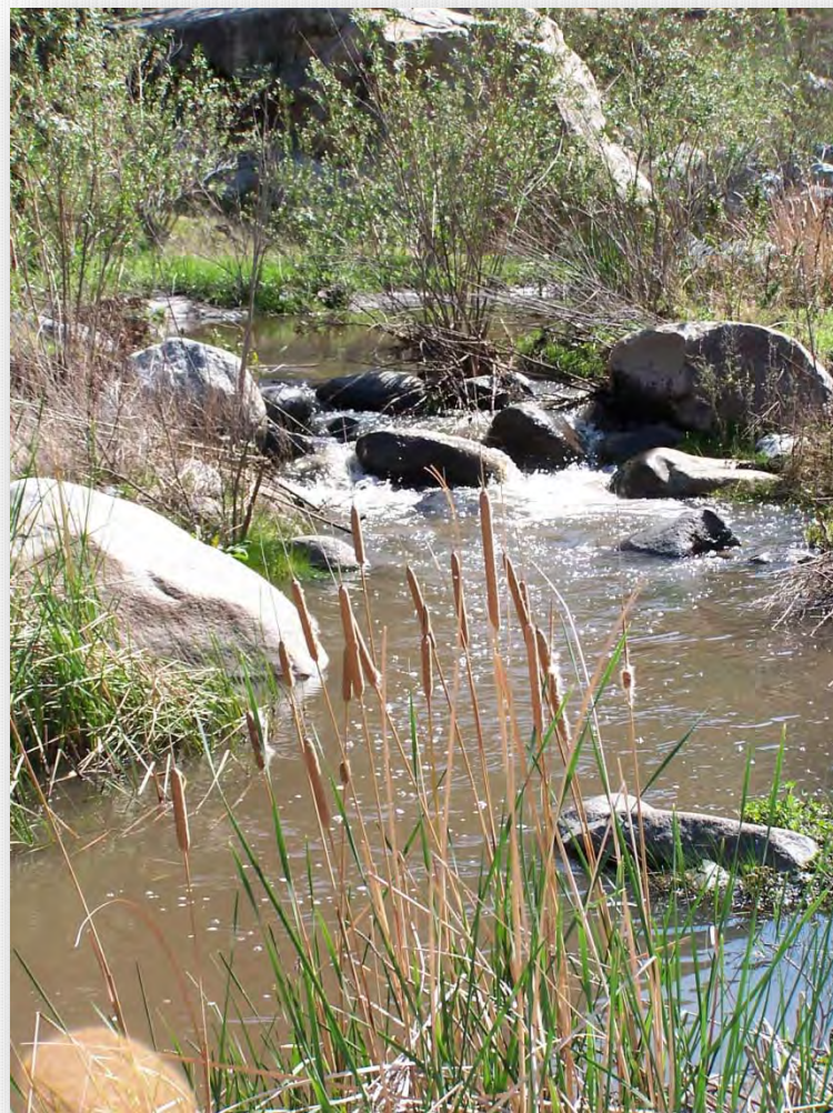
La Jolla Band of Luiseno Indians