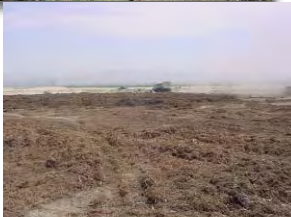
Fillmore Street dump site before EPA and CIWMB cleanups, and after cleanup with mulch from Torlaw site.