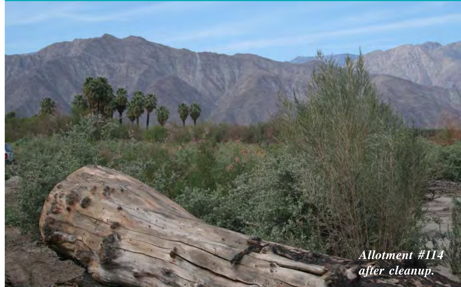
Allotment #114 after cleanup.

The Torres Martinez Solid Waste Collaborative is comprised of 25 federal, state, and local agencies, the Torres Martinez Tribal Government, and non-profit organizations working to prevent illegal dumping on the Torres Martinez Reservation. Since its inception in April 2006, the collaborative has closed all major dumps and successfully prevented the creation of new dumps on the reservation; significantly reduced dump fires; cleaned up over 20 dump sites; put access controls in place to prevent future dumping; and initiated Targeted Brownfields Assessments to facilitate productive reuse of former dump sites.