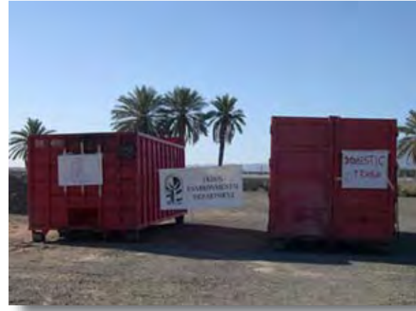
Trashbusters community wide cleanup event.

Members of the taskforce include the Torres Martinez Tribe, Center for Community Action and Environmental Justice, Coachella Valley Association of Governments, California Department of Toxic Substances Control, Riverside County Code Enforcement & Community Improvement Department, Riverside County Fire Department, and EPA.