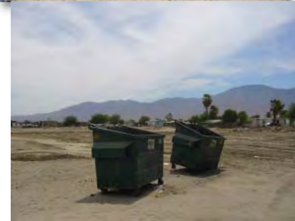
Trailer park waste management, before and after EPA enforcement.

The Desert Mobile Home Park held a community-wide household hazardous waste collection event on October 20, 2007, where community members could bring lead-acid batteries, washers and dryers, refrigerators, condensers and scrap metal; computer hard drives, keyboards, mattresses, microwaves, TVs, computer monitors, and used oil. These materials were then taken to the appropriate recycling and disposal facilities.