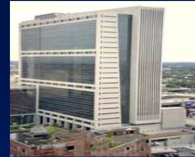
Region II Atlanta, GA