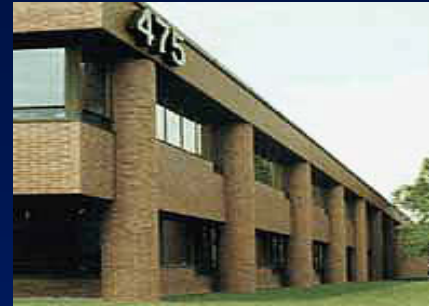
Region I King of Prussia, PA