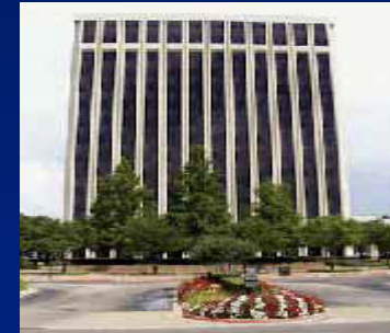
Region IV Arlington, TX