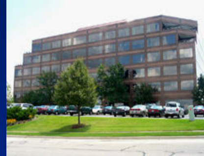
Region III Lisle, IL