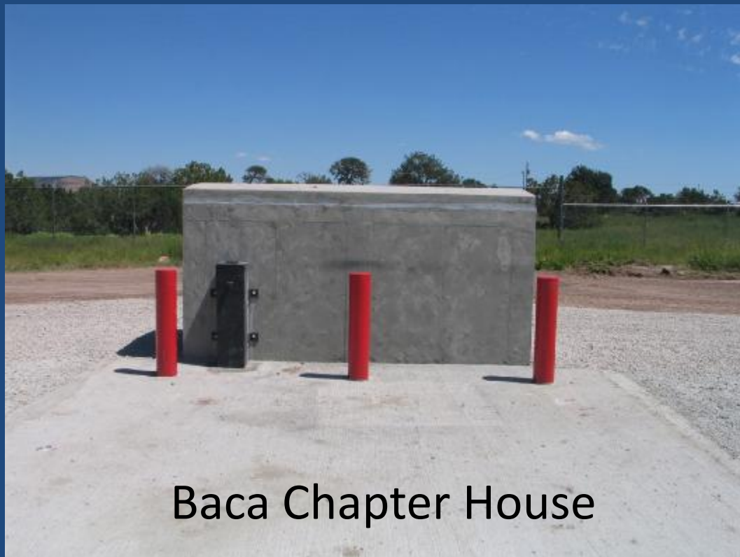
Baca Chapter House