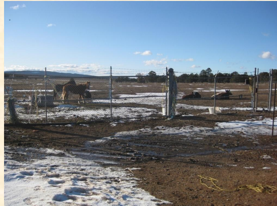
Mariano Lake Mine