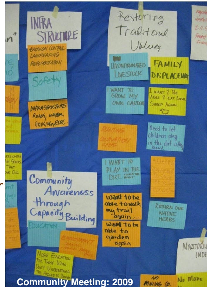
Community Meeting: 2009