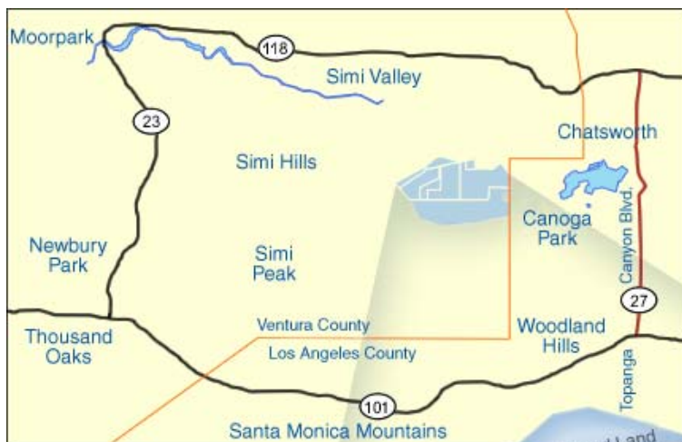
Figure 1: Santa Susana Field Laboratory Site

The results of the PA/SI investigation are available to the public in the three existing SSFL repositories at the Simi Valley Library, California State University, Northridge, and the Los Angeles Public Library (see library contact information at the end of this fact sheet). They are also posted on the EPA Region IX webpage ( http://www.epa.gov/region09/waste/sfund/santasusana/index.html ).