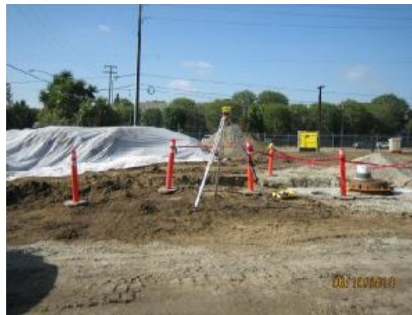
Overview of Montrose property looking at treatment pad area (6/19/2013) Trench and Survey Equipment at DelAmo and Vermont (6/19/2013)