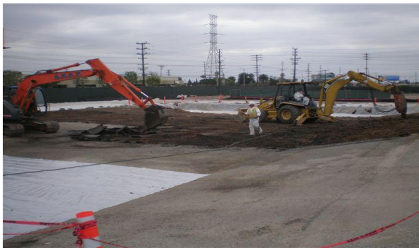
Removing asphalt at treatment pad (4/24/2013)

The injection and extraction pipelines on the Montrose property were installed and successfully leak-tested this past month. The two extraction wells located on Montrose were completed and tested. Approximately, one-third of the excavation preparing the treatment plant foundation has been completed. The two re-injection wells located at Del Amo Ave. and Vermont Ave. have been installed. EPA conducted a total of eight work inspections and found all work was conforming to approved design, and good construction practices were being used. There were no exceedances of noise levels outside the Montrose property. The dust monitoring was comprehensive and, with one exception, was in compliance with project requirements. There was one hour during the past month where there were a few dust level exceedances; however, modifications were made to the dust control measures, and the dust monitoring results returned to within project standards. EPA collected dust samples which are currently being analyzed for DDT.