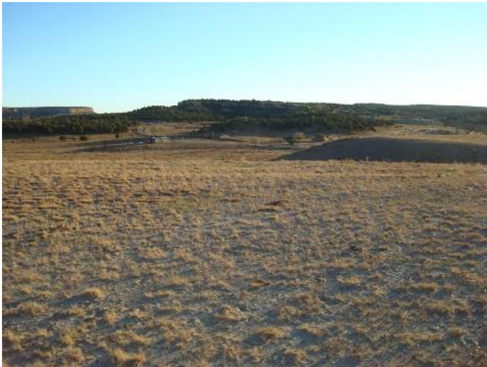
Photo 4: Southern portion of mine and residence located to the south