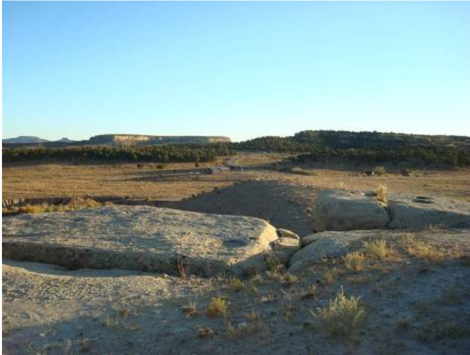
Photo 1: NE Churchrock Quivira Mines (No.1) site, towards the south