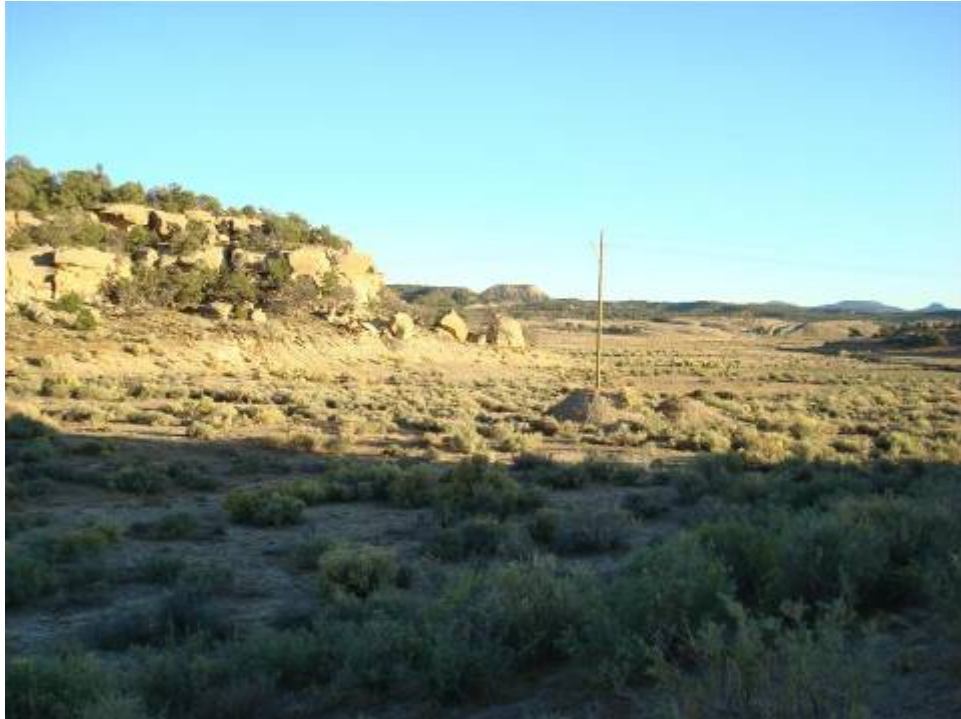
Photo 2: Original grade at power pole in northern portion of mine, towards the north