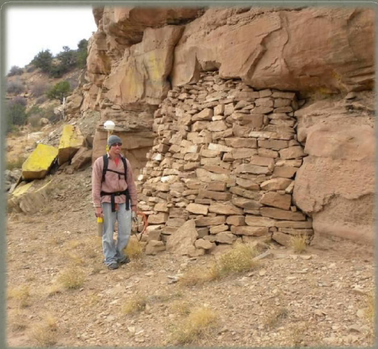
Abandoned Mine Assessment