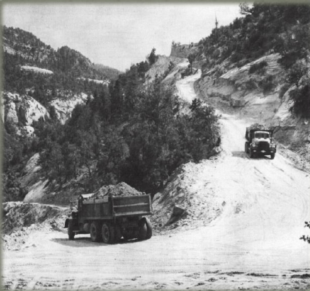
Historical Uranium Mining on the Navajo Nation