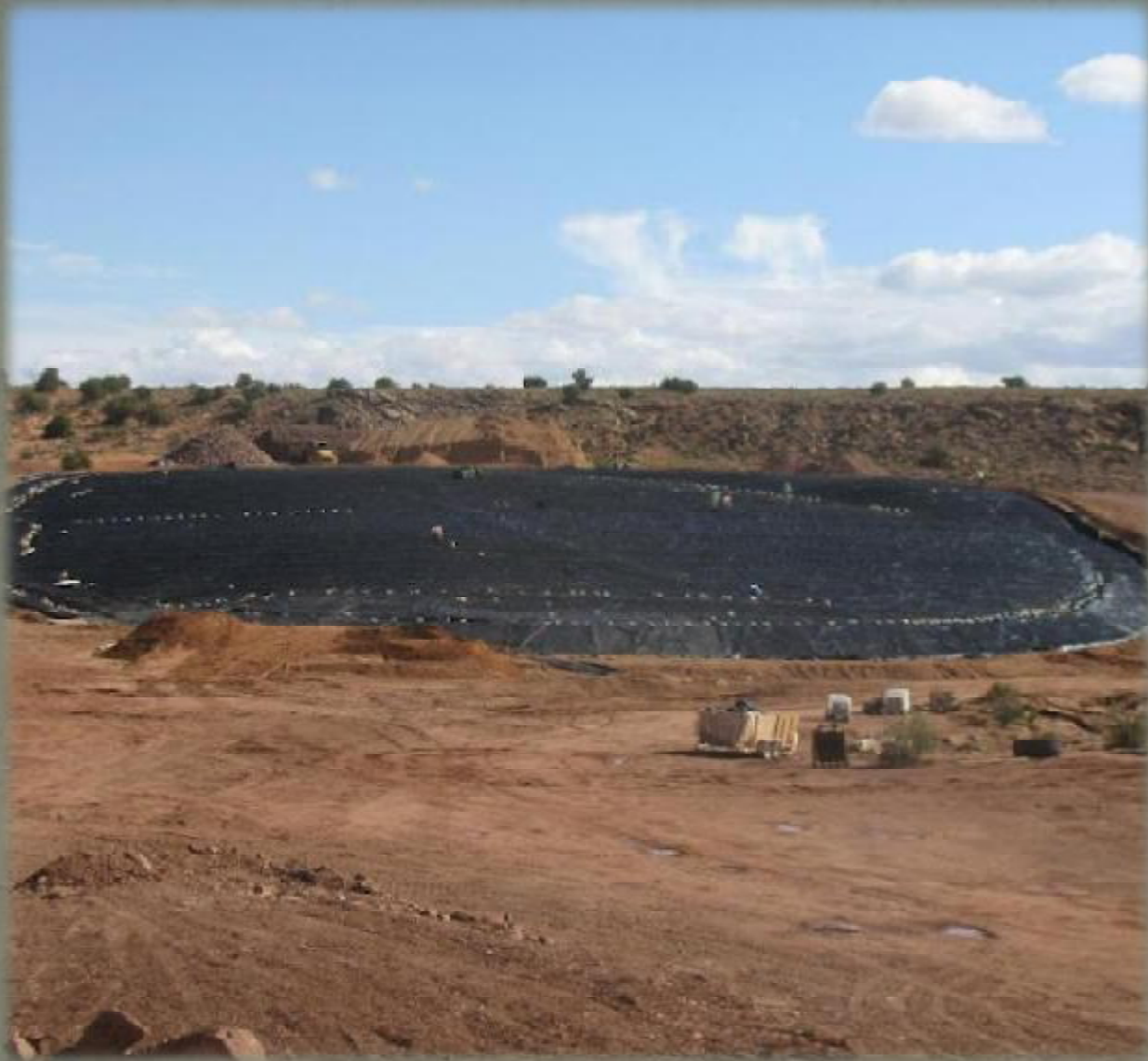
Mine Site Clean-up