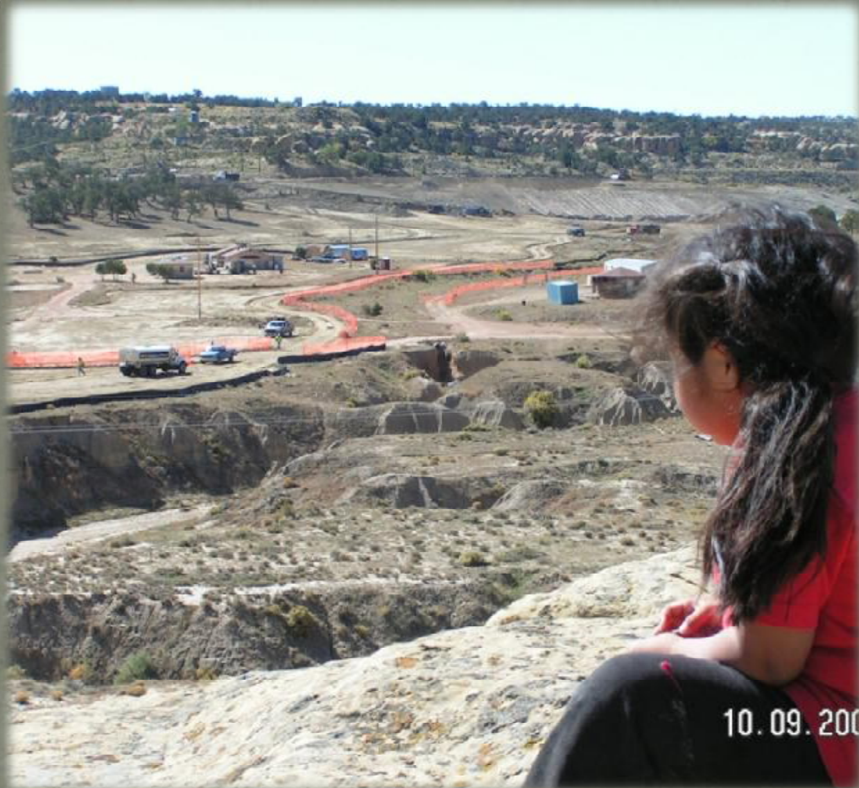
Mine Site Clean-up