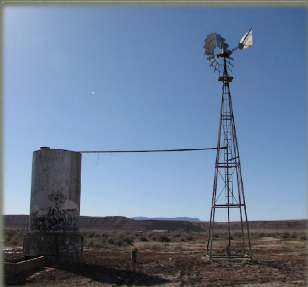
Contaminated Water Sources