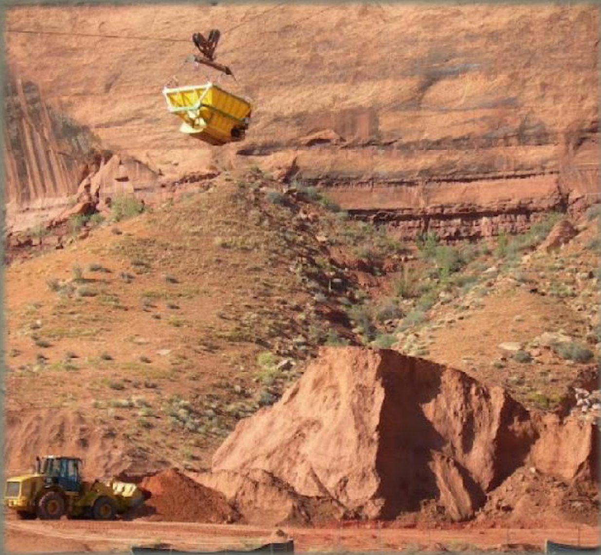
Mine Site Clean- up