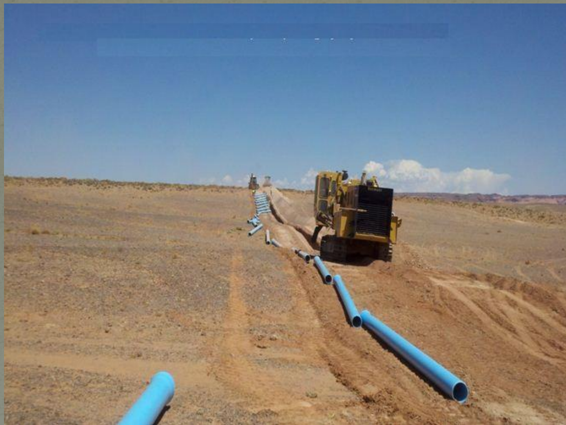
New Water Infrastructure