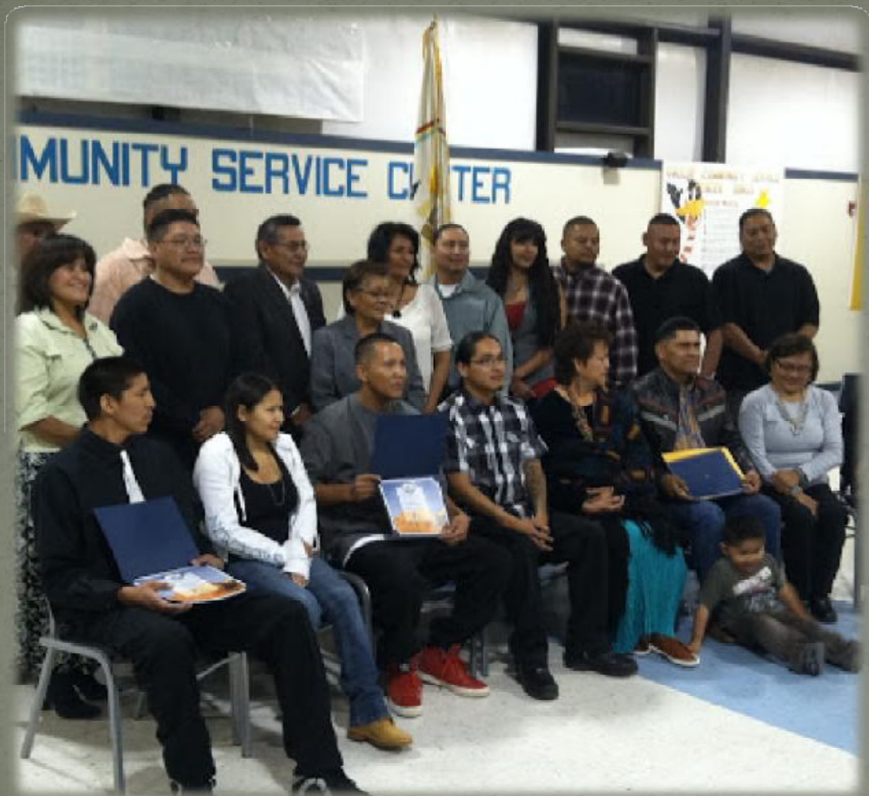
Superfund Job Training Program Graduates