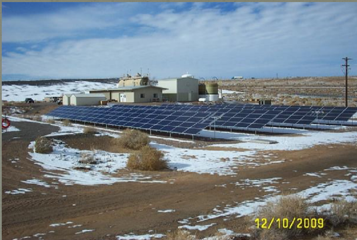
Tuba City Disposal Cell Reuse