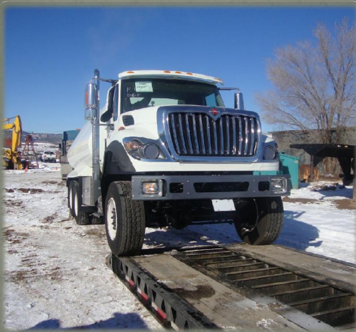
New Water Delivery Truck