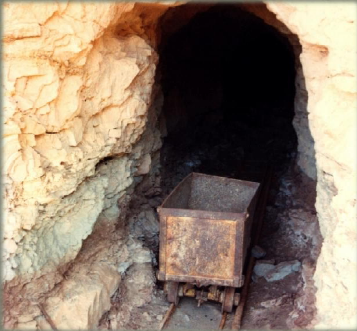
Historical Uranium Mining on the Navajo Nation