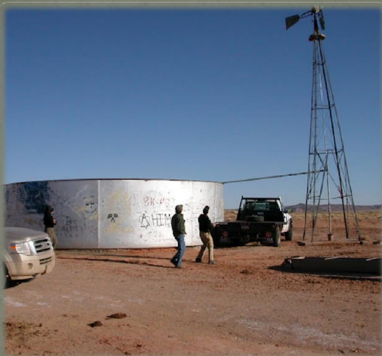
Contaminated Water Sources