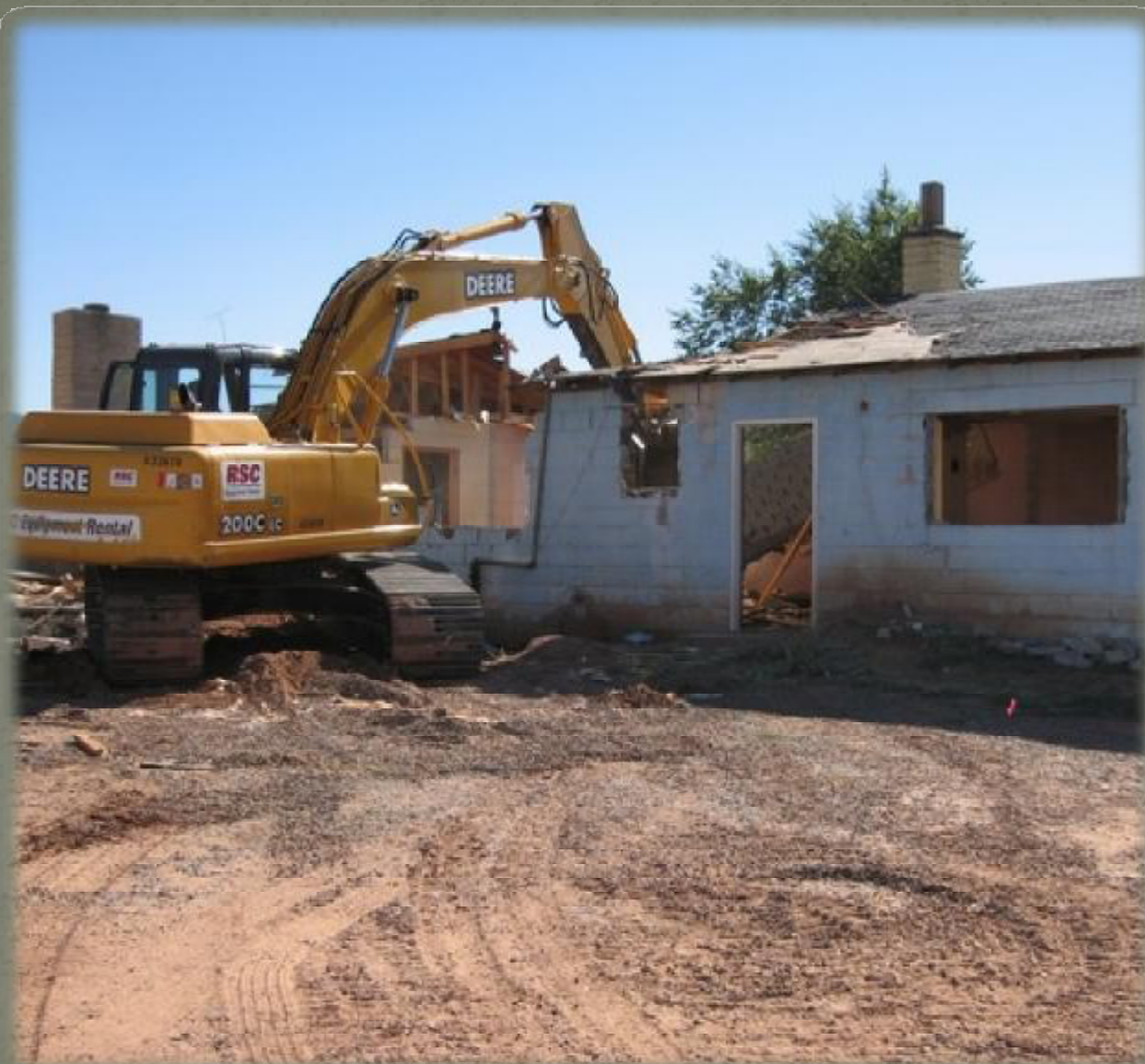
Contaminated Structure Removal