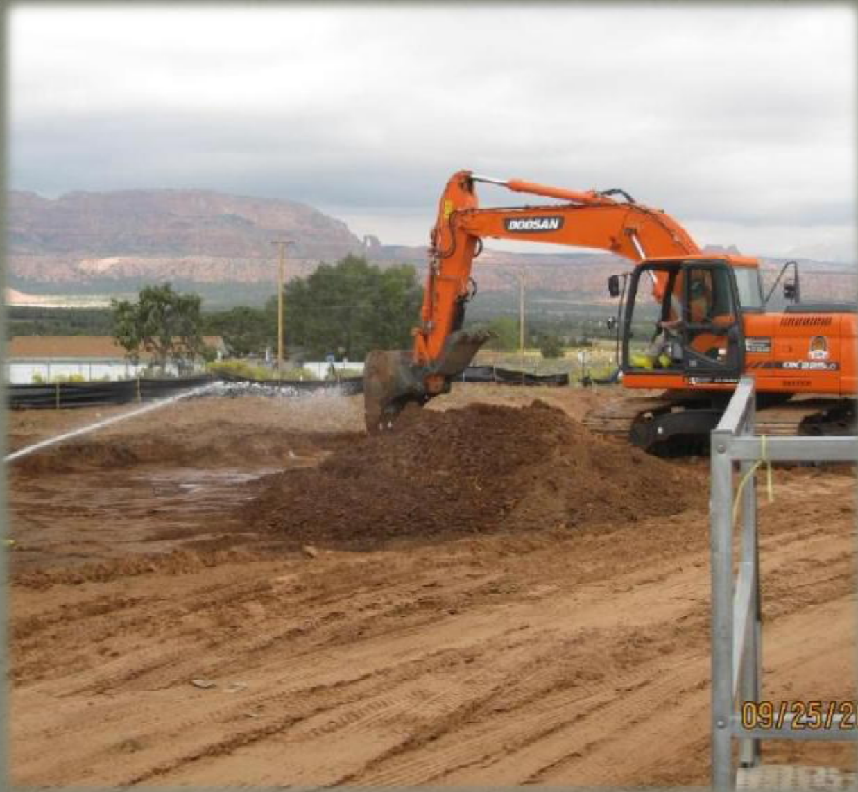
Mine Site Clean-up