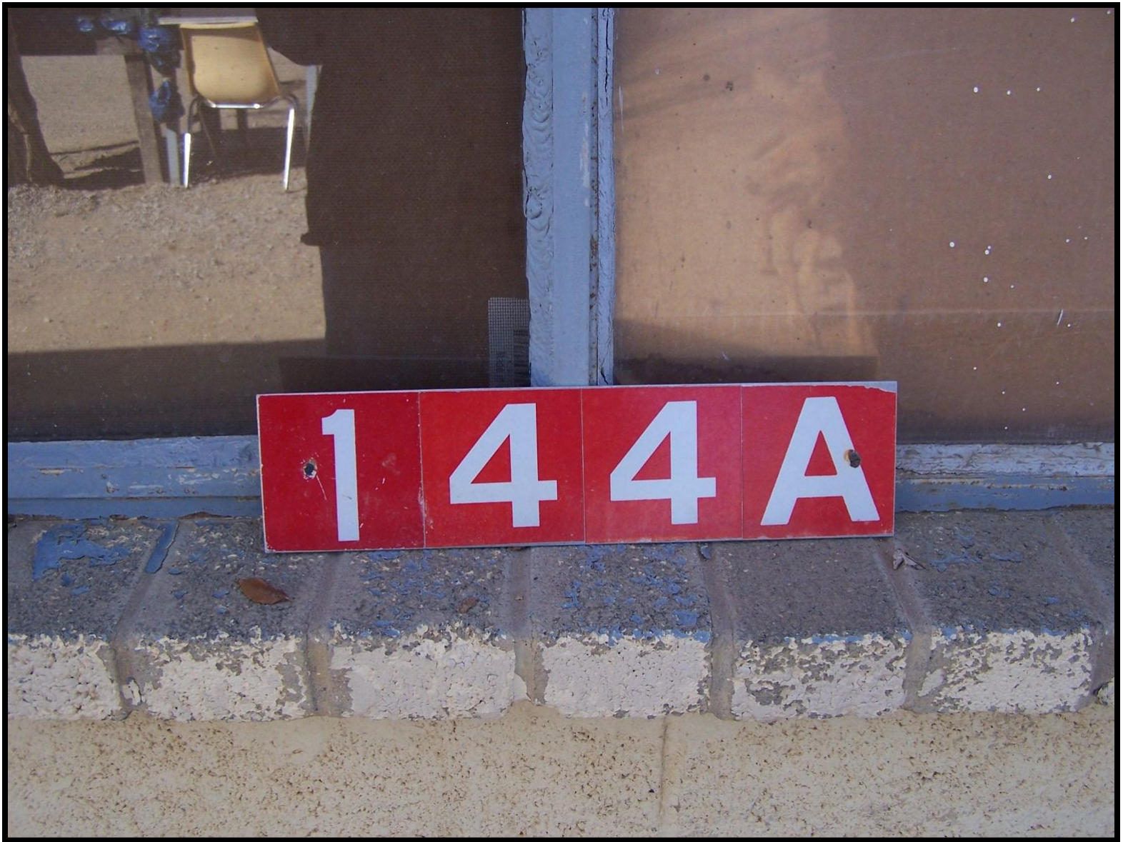
Rural Address numbers