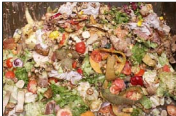
Figure 3. This post-consumer food waste will produce energy and a soil amendment when anaerobically digested and then composted.

• Performance contracting is one way to pay for the infrastructure upgrades needed to implement anaerobic digestion at a wastewater treatment facility.