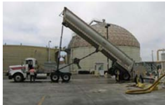
Food waste being unloaded at EBMUD Main Wastewater Treatment Plant. For more information on this project, visit http://www.epa.gov/region9/foodtoenergy .

This year's Pacific Southwest Organic Residuals Symposium, PORS 2009, looks at ways to achieve greenhouse gas reductions, select and fund new technologies, and coordinate cross-media regulations. The symposium is intended for those involved in putting organic residuals (manure, biosolids, greenwaste, food waste, etc.) to their best uses: the public and private sectors, researchers, students, laboratory technicians, and environmental groups.