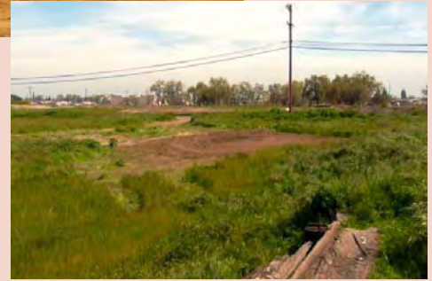
Removing contaminated soil from site (above) Site ready for Civic Center and Park redevelopment (below)