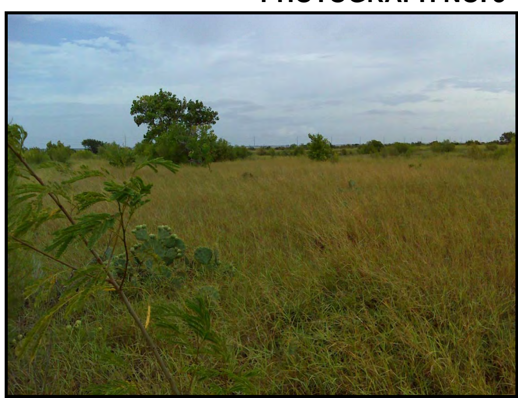
PHOTOGRAPH NO. 4

Date: <u>08/26/13</u> Direction: <u>NW</u>