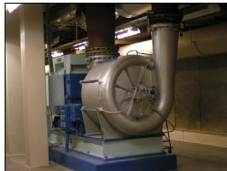
Blucher Poole Wastewater Treatment Plant Bloomington, Indiana

Because energy management involves facility-specific energy conservation measures, it is crucial to understand and document the utility's activities and operations. Regardless of whether an energy audit is performed, in-house utility staff should be involved. Staff understand current equipment and operating procedures, and often have professional experience to recommend or take ownership of energy improvements. During facilitated discussions at staff meetings or energy team meetings, in-house utility staff can document activities and operations, and set priorities.