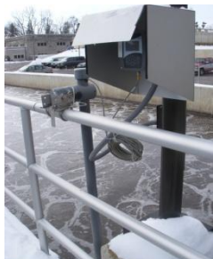
Dissolved Oxygen Meter, Wastewater Utility Mishawaka, Indiana

Legal and other requirements require a considerable amount of monitoring and measurement in the utility. In developing a procedure that shows how to monitor and measure the energy management system, ask the following questions: What additional metrics should be included in the energy management system? What are the monitoring capabilities? Who is collects the information? Will the results accurately reflect benefits and improvements? Are there opportunities for improvement such as more instrumentation or automated data collection?