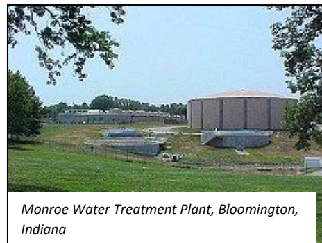
Monroe Water Treatment Plant, Bloomington, Indiana