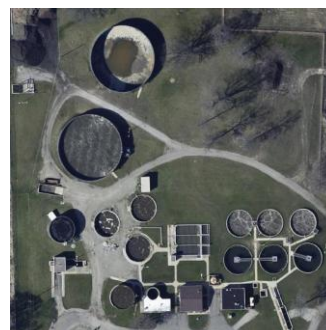
Angola, Indiana Wastewater Treatment Plant

Don't hesitate to ask senior management what information and data they would like in the Management Review. Here are a few topics other water and wastewater utilities have included.