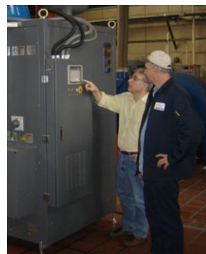
Mishawaka Wastewater Treatment Plant, Mishawaka, Indiana