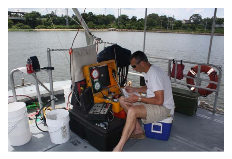
Figure 6. Box operator monitoring the diver's air supply and depth during scientific dive operations.

A qualified and trained person will be dedicated to running the surface-supply control box. This person's sole responsibilities are maintaining sufficient breathing gas delivery and communications with the diver. The dive control box operator, in conjunction with the divemaster, must be aware of the diver's profile (maximum allowable depth and bottom time) and actual bottom time and depth to ensure that all diving is performed in a safe manner and the diver does not exceed the no-decompression limits (NDL) or the dive-specific profile limits. The control box operator is directly responsible for the safety of the diver. In certain circumstances, at the discretion of the divemaster, the surface-supply control box operator may also maintain the dive logs.