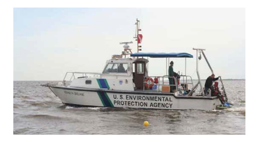
Figure 1. EPA conducting surface-supplied dive operations aboard the EPA vessel Biglane.

Surface-supplied diving is unique compared to free swimming scientific divers' more routine use of self-contained underwater breathing apparatus (SCUBA) to accomplish their objectives. Using surface-supplied air, the diver is provided a virtually unlimited supply of breathing gas from tanks or a compressor on the surface through a three-part umbilical consisting of a breathing gas hose, a pneumofathometer (pneumo) hose and communication line (comm line)/strength member to the diver.