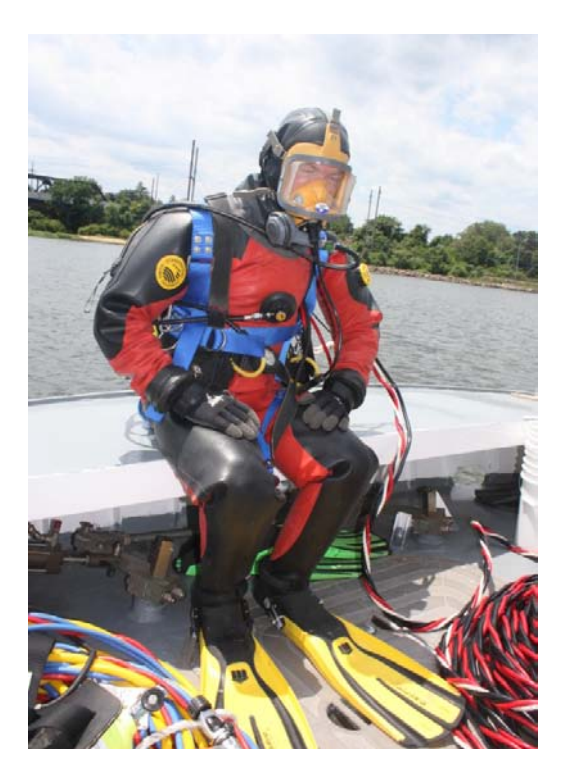
Figure 2. An EPA surface-supplied diver prepares to enter the water to collect sediment core samples at a Superfund site in New Jersey.

Depending on the planned dive profile, EPA typically uses air or enriched air (nitrox up to 40% oxygen), provided the equipment is approved by the manufacturer for that oxygen concentration and/or has been oxygen cleaned. Check the specifications or contact the manufacturer of the control box before using nitrox.