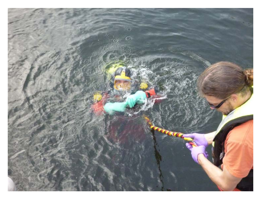
Figure 4. An EPA surface-supplied diver is held at the surface as the tender maintains line tension with two hands.

After the gas tanks are attached to the system, the operator should blow out the breathing gas line to remove any dust or particles by briefly opening the outlet gate; then it can be attached to the diver's gas supply manifold block. The control box communications system can be operated either with a microphone and the built-in speaker so all surface personnel can hear the diver or the box operator can wear headphones to block out external noise (e.g., machinery, wind, extraneous conversation). When using headphones, the operator may turn off the speaker switch so that only the box operator can hear the diver. When in this mode, the operator must relay information to dive tender and other surface personnel. The set-up should be close enough to the dive operation and tenders to allow clear communication between the operator and dive tender. Prior to donning the helmet or FFM, the diver and control box operator must perform a communications check. The surface end of the comm line is wired with connectors for attachment to the control box, and the diver end of the comm line is wired to attach to the diver's communication line (microphone and earphones). The control box has adjustment knobs for surface-to-diver and for diver-to-surface volume. Proper two-way communications should be established prior to initiating dive operations.