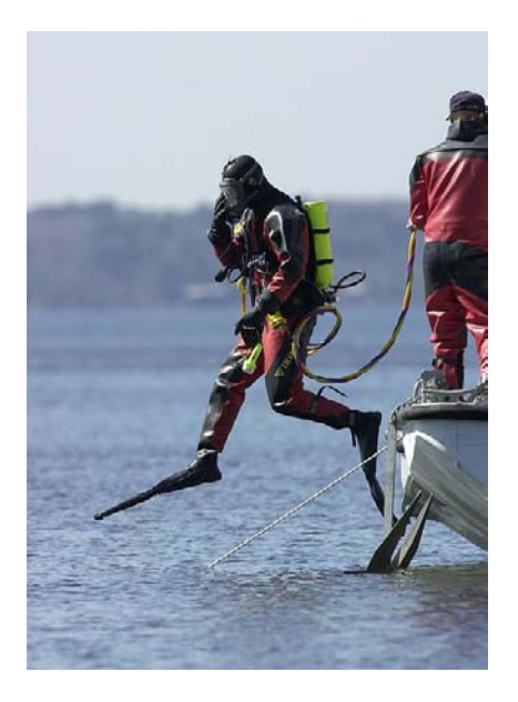
Figure 5. Diver entering the water to conduct a bottom search in zero visibility conditions.

The area in which the diver dresses and uses for access to the water should be kept clear of all debris and items that could present slip, trip or fall hazards. The tender should always be available to physically assist the fully dressed diver. The tender should assist the diver in donning all equipment and ensure all belts, clips and harnesses are securely fastened. The dive tender and/or the box operator should ensure that all air systems and communications are functioning properly. The tender should complete all pre-dive checks as specified in a Surface-supplied Air Checklist.