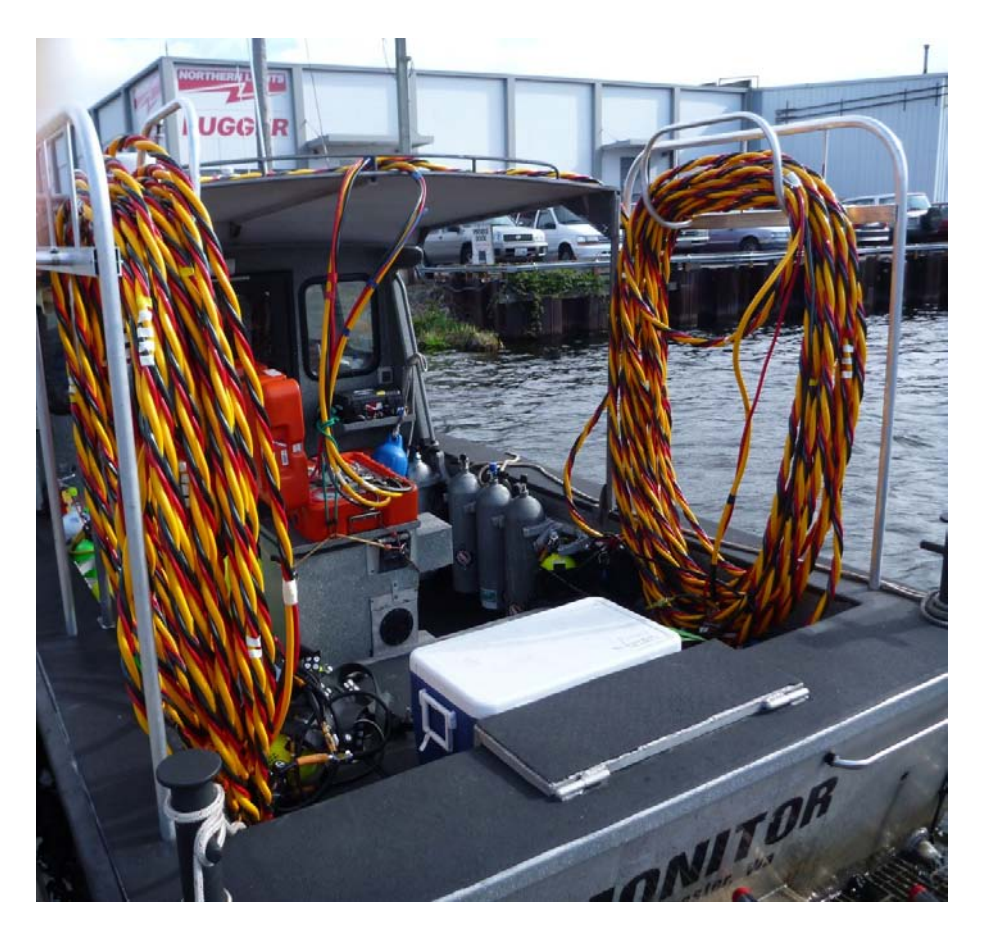
Figure 8. Surface-supply hoses should be managed in the vessel's "hot zone" for polluted water operations.

Due to the virtually unlimited air supply, surface-supplied diving offers the scientific, polluted water diver the ability to conduct extensive decontamination without exposing the diver. For example, at some dive sites, an antimicrobial solution may be required to have "contact time" on the diver before he or she may remove the mask or helmet. The surface-supplied gas allows the diver this extended time to egress his or her personal protective gear safely.