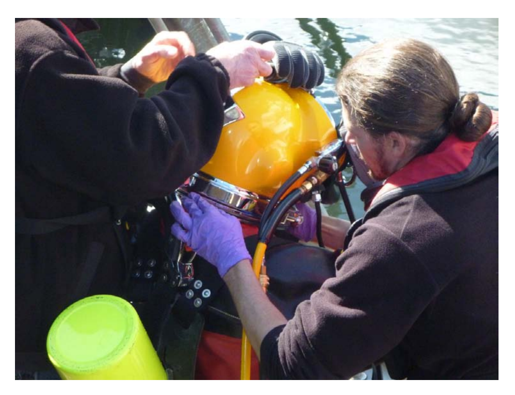
Figure 7. An EPA diver dons a dive helmet for polluted water dive operations.

There are many advantages to tethered scuba, such as being able to hold a diver on station in current, communicate with the diver using clear hard line comms, pass instruments to the diver, and easily navigate a diver to a location with directions relative to the umbilical.