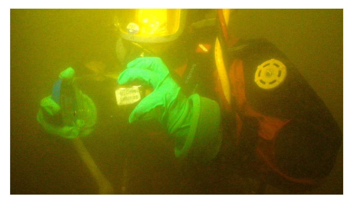
Figure 9. An EPA surface-supplied scientific diver conducts sediment sampling.

For some scientific dive tasks, it is not always more efficient or safe to use a buddy team of free swimming scuba divers compared to a single diver on surface-supplied air. Often a task may be more efficiently performed by a single diver and the second diver's only purpose is to be the buddy for the primary diver. In this case, a second non-essential diver increases costs and hazards. This is also the case when diving in water with limited or no visibility, the primary diver is trying to accomplish the required task while remaining aware and in contact with his buddy throughout the dive.