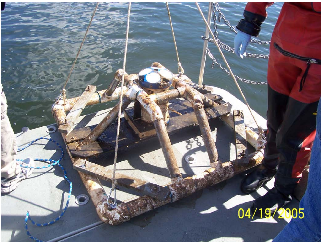
Acoustic Doppler Current Meter (ADCM)

Return to EPA Region 10 Dive Team homepage.