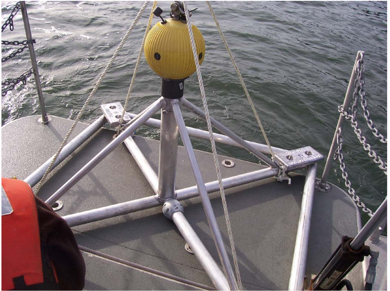
S4 current meter