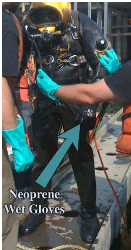
Figure 2. A diver exiting the water at a Portland Harbor Superfund Cleanup site.