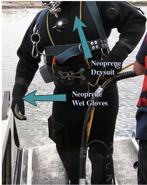
Figure 1. A diver exiting the water at a Portland Harbor Superfund cleanup site.