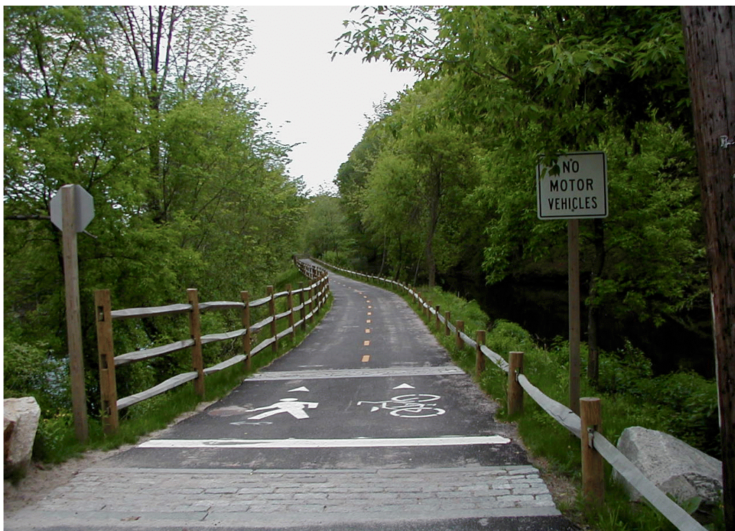
Blackstone River Bikeway, Lincoln, RI

U.S. EPA, Region I Offices of Site Remediation and Restoration March, 2002