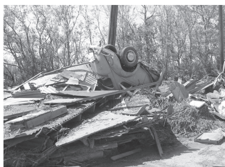
Debris from Hurricane Katrina was estimated at 22 million tons—more than any American city produces in one year.

EPA personnel and contractors were some of the first relief workers on the scene just before and immediately after Hurricane Katrina struck the Gulf Coast on August 29. EPA has over 1,200 employees and contractors cur-