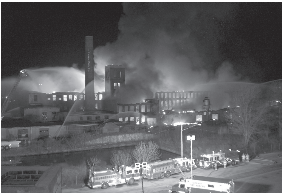
InterRoyal Fire - April 26, 2005

(cont. from pg. 3) miles long by one-half mile wide. In addition to 22 fire companies, dozens of federal, state, regional, and local agencies responded to the fire, each bringing an important solution to the emergency response effort.