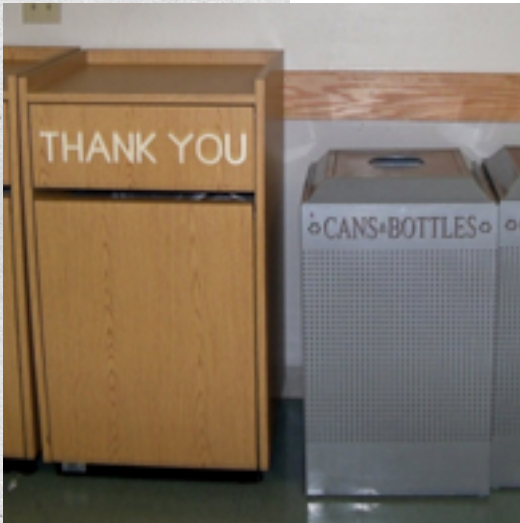
Bottle and Can recycling container

Aramark. Clear plastic counter top bins are emptied into large rolling barrels for easy movement to the loading dock.