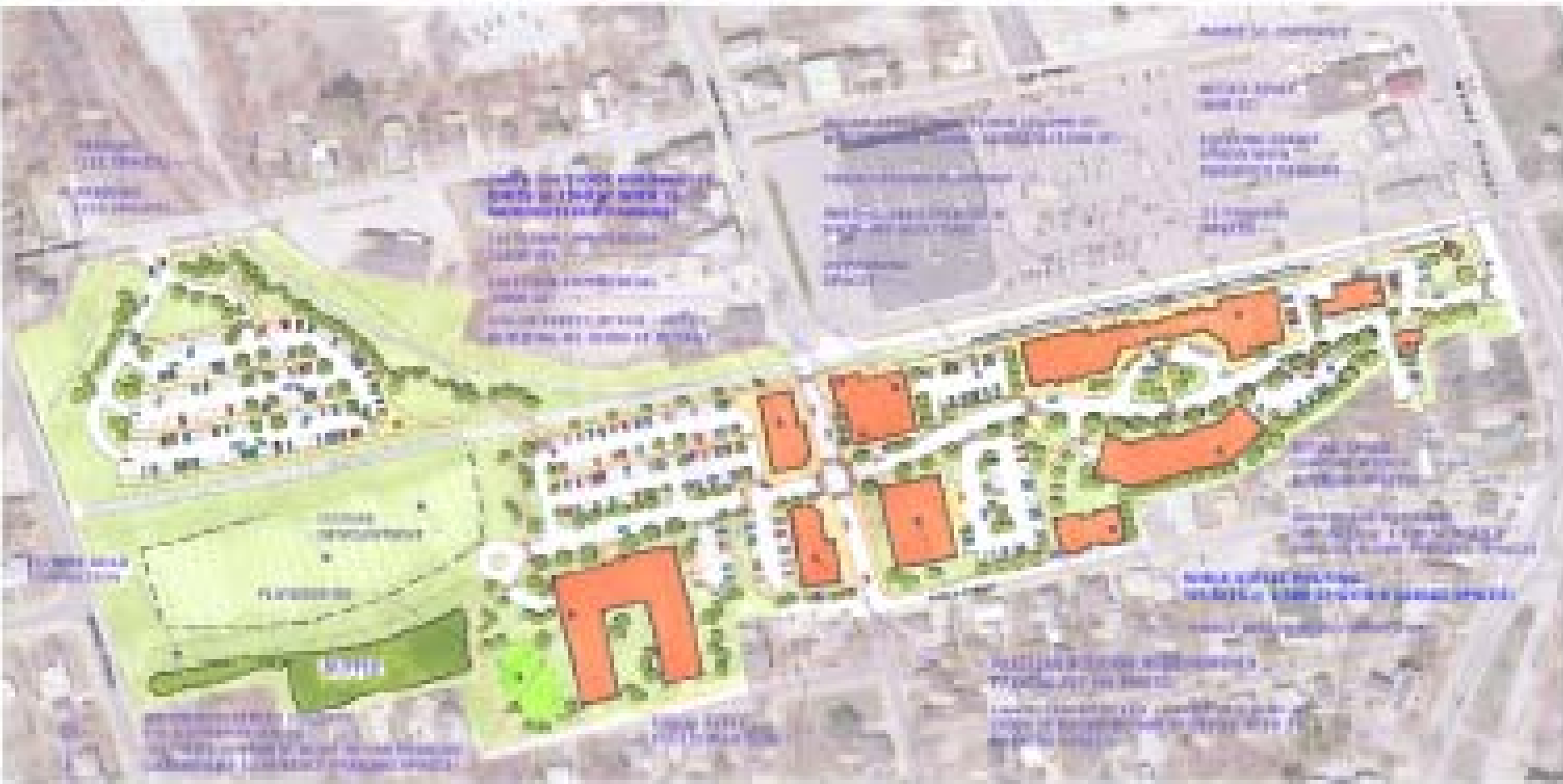
Marine Street Train Station - Future Development BRUNSWICK, MAINE