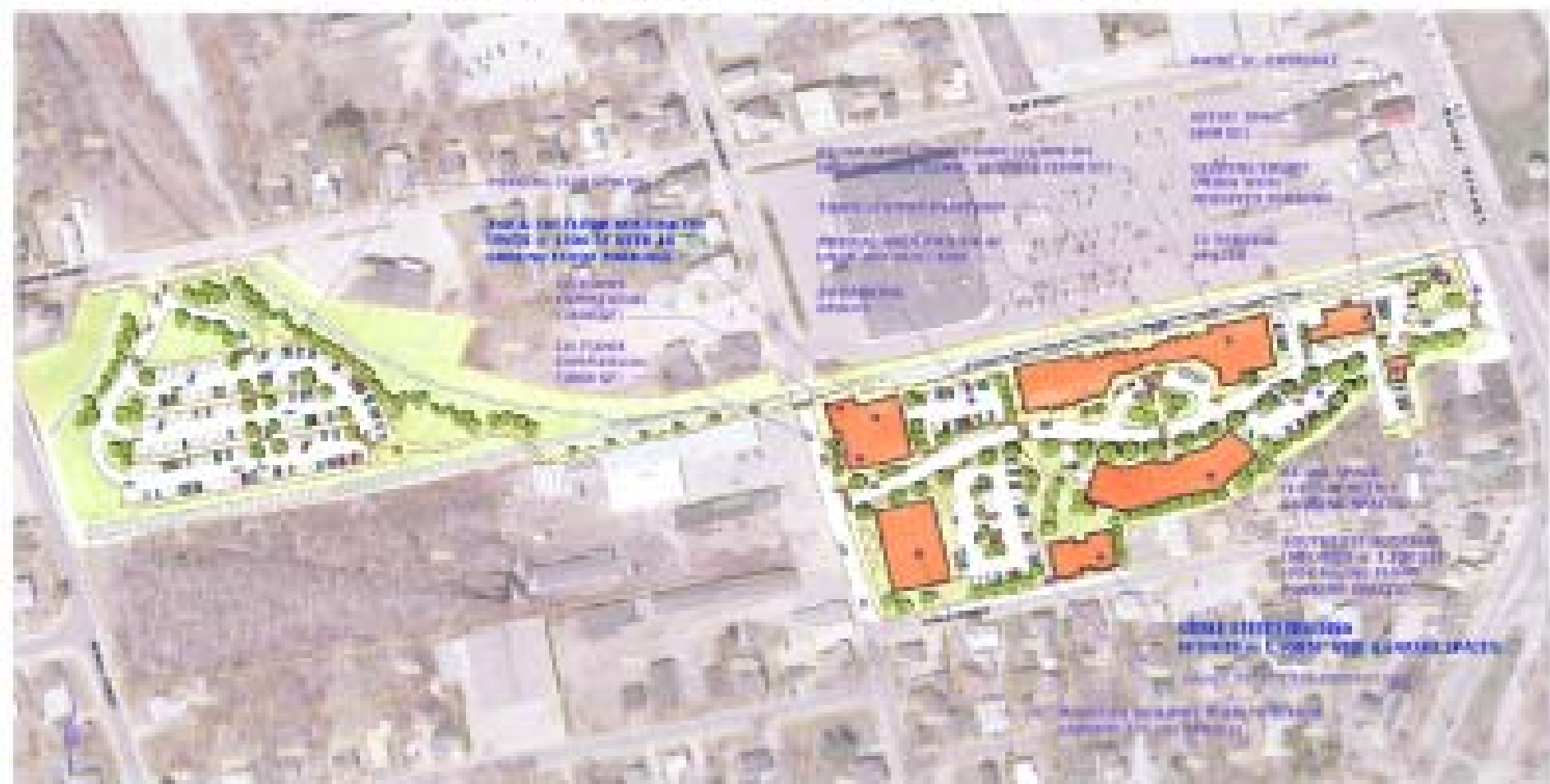
Maine Street Train Station BRUNSWICK, MAINE