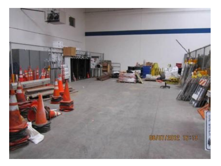
Photograph 3. Additional view of portion of warehouse used for storage.