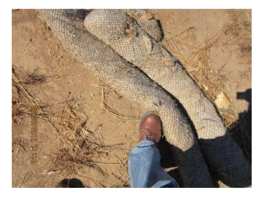
Photograph 4. Close-up view of straw wattles along the eastern edge of the site which were not entrenched into the ground.