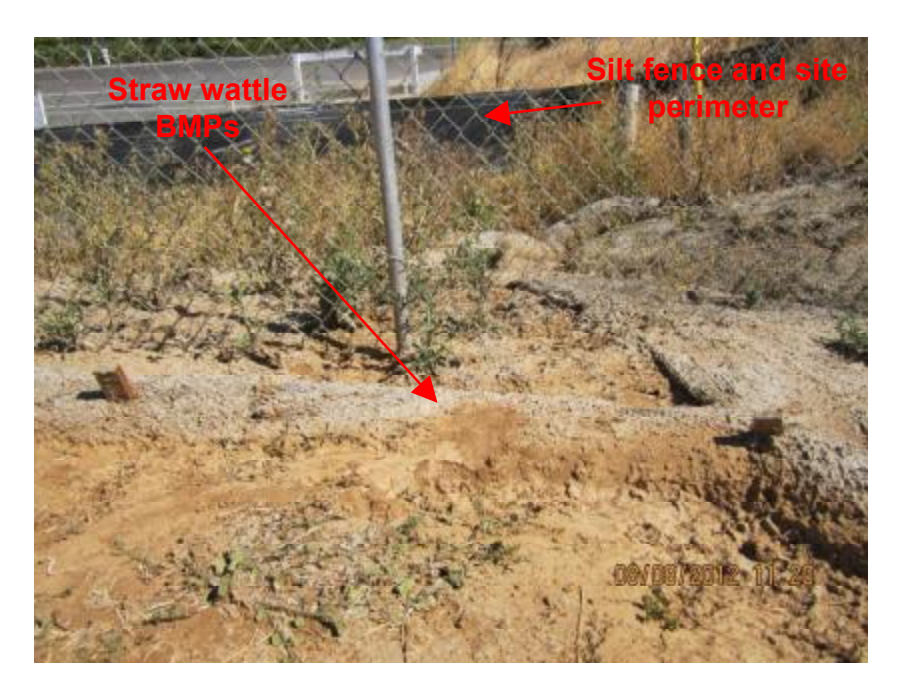
Photograph 6. Close-up view of straw wattle which had accumulated sediment to its full height.