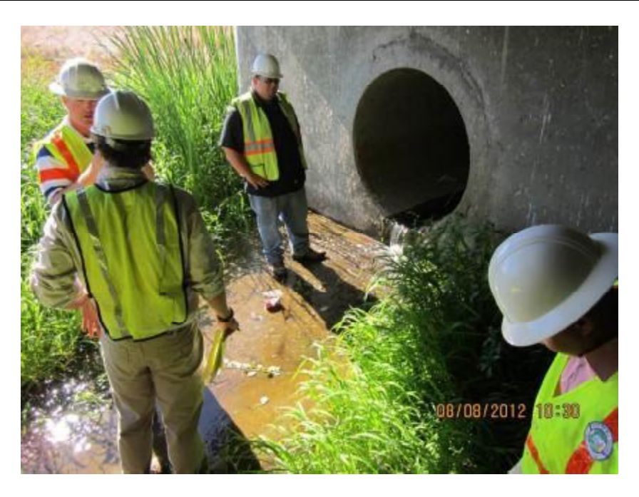
Photograph 3. View of outfall to Shed B Channel. Note dry weather flow from outfall.