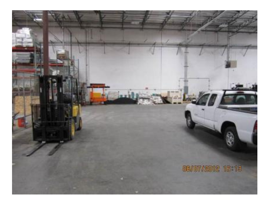
Photograph 2. View of portion of warehouse used for storage.