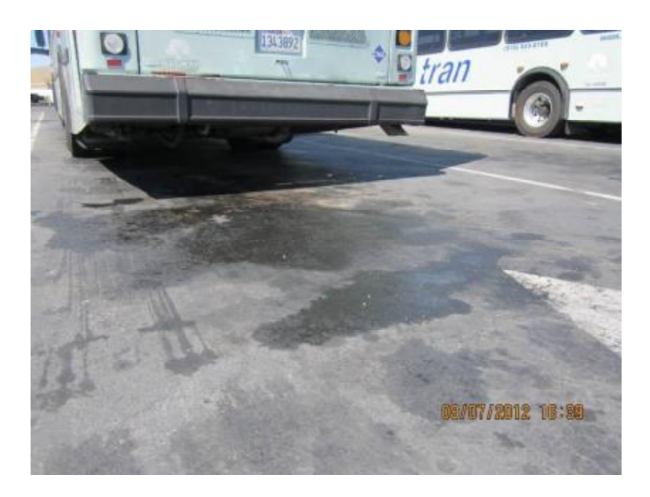
Photograph 10. Closer view of staining shown in Photograph 9.