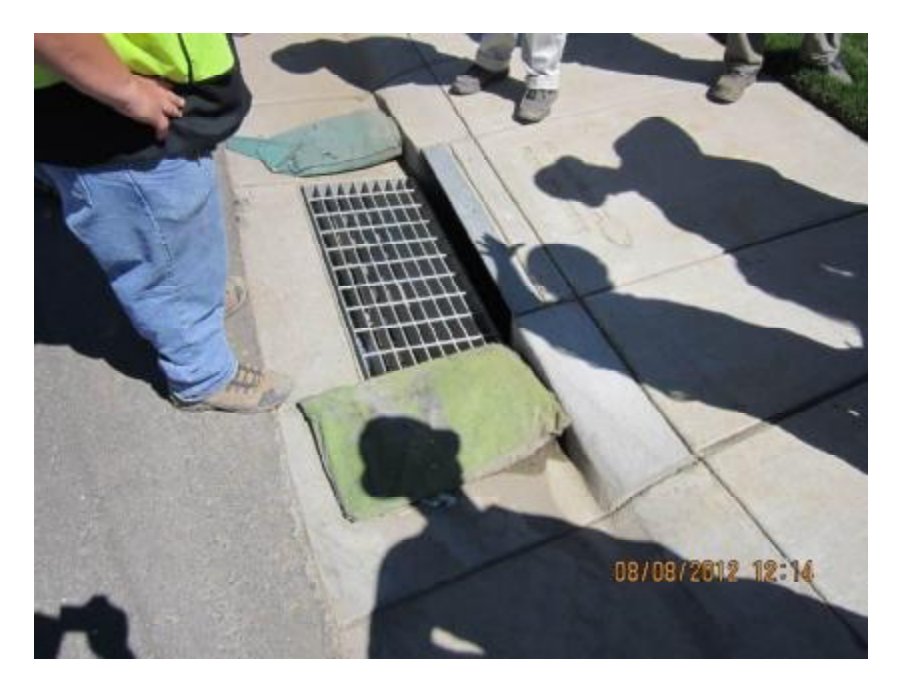
Photograph 4. View of deteriorated gravel bags used for storm drain inlet protection.