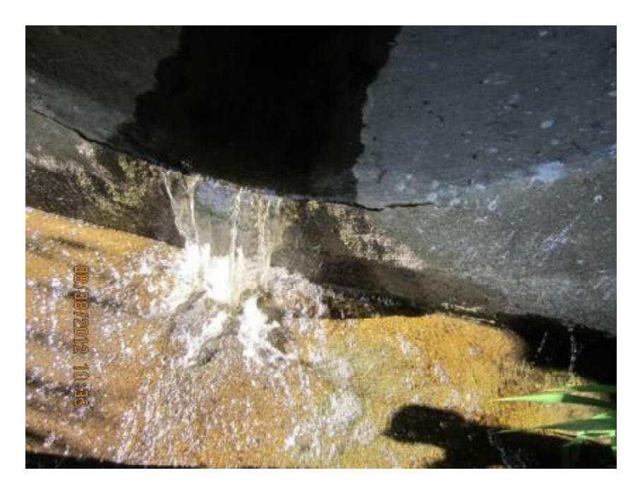
Photograph 4. Close-up view of dry weather flow from outfall.