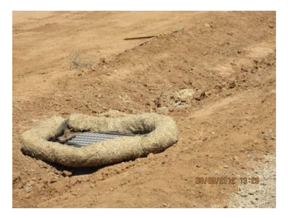
Photograph 8. Laguna Corporate Center Construction Project – View of storm drain inlet in parking lot area surrounded by straw wattles which were not entrenched into the ground.