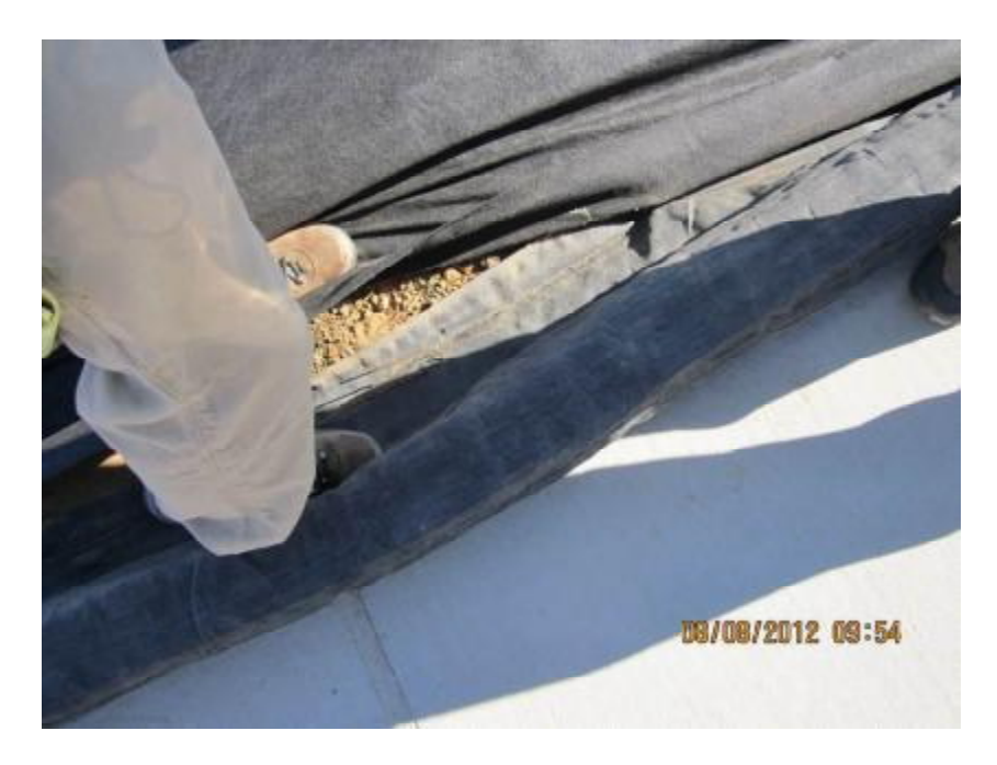
Photograph 2. View of "heavy weight wattle" sediment control BMP which was not entrenched into the ground.