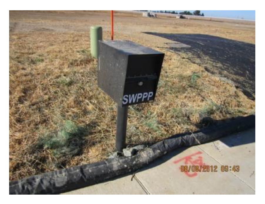
Photograph 1. View of container at construction site for the project's SWPPP.