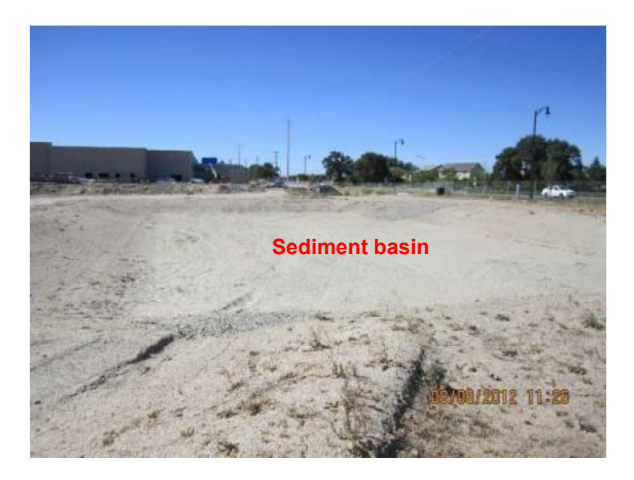
Photograph 2. View of temporary sediment basin near the northwest corner of the site.