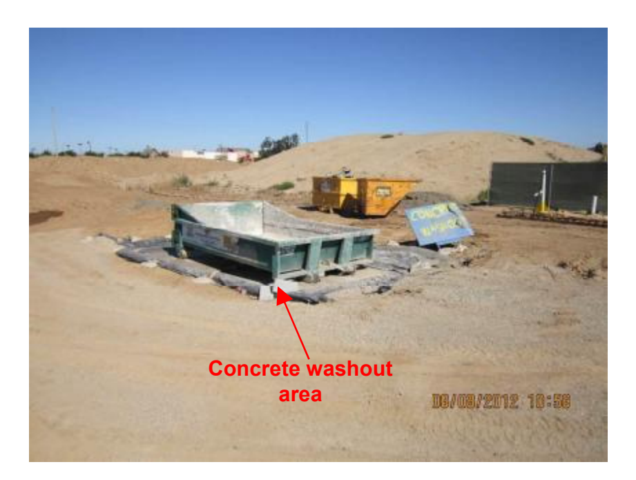
Photograph 1. View of concrete washout area at the construction site.