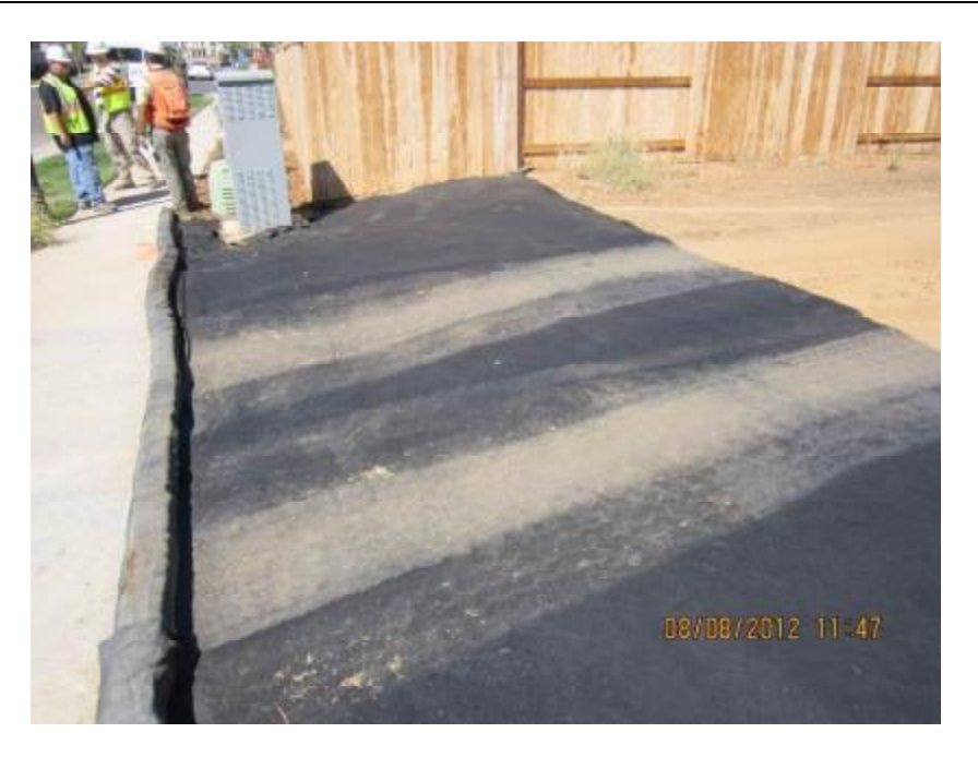
Photograph 3. Close-up view of area used for vehicle access shown in Photograph 2.