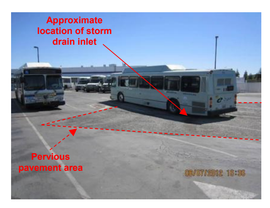
Photograph 6. View of bus parked over a storm drain inlet in an area of pervious pavement.

Photograph 5. View of drum of unlabeled container of fluid stored in an uncovered area without secondary containment adjacent to the vehicle wash bay shown in Photograph 4.