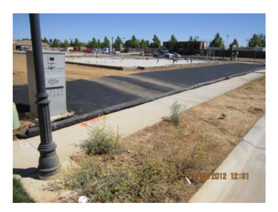
Photograph 2. View of area with geotextile coverage that was used for vehicle access.