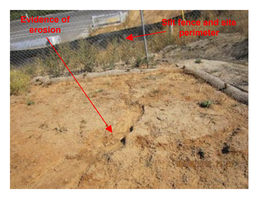
Photograph 5. View of straw wattle BMPs and silt fence BMP installed near the northeast corner of the site. Note evidence of erosion in foreground of the photograph.