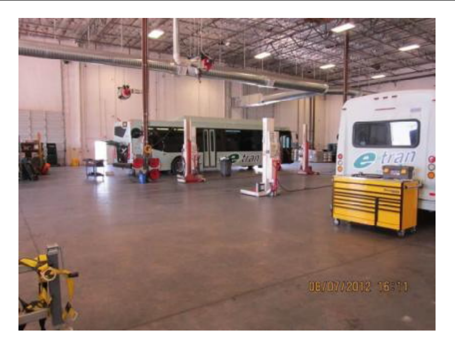
Photograph 1. View of portion of warehouse used for vehicle maintenance.