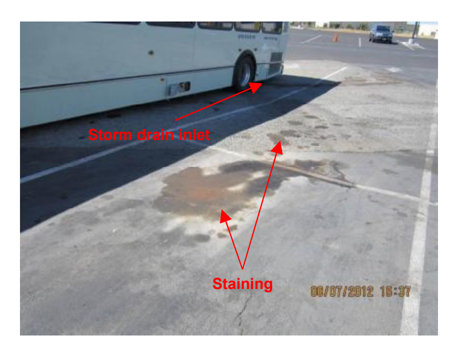
Photograph 8. View of staining on pervious and impervious ground surface upgradient of storm drain inlet shown in Photographs 6 and 7.