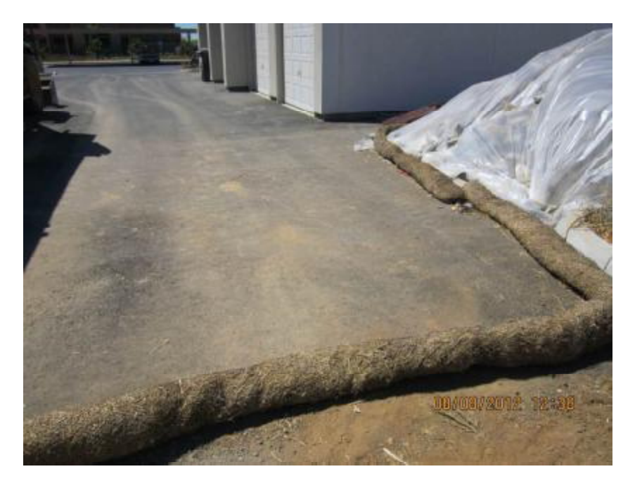
Photograph 4. Additional example of stockpile surrounded by straw wattles which were not entrenched into the ground.

Photograph 3. View of stockpile along northern perimeter of the construction site. Note that the straw wattles placed around the stockpile were not entrenched into the ground.