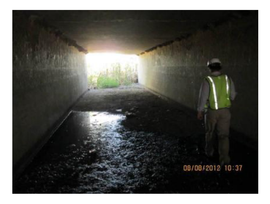
Photograph 2. View of box culvert access to outfall.