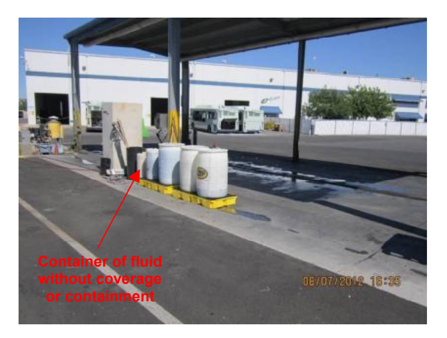
Photograph 4. View of covered vehicle wash bay at the facility.