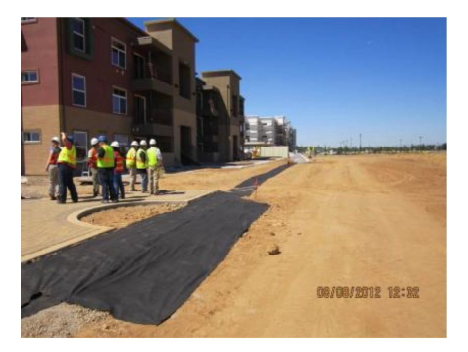
Photograph 2. View looking west of northern perimeter of the construction site. Note that BMPs had not been installed for perimeter control.