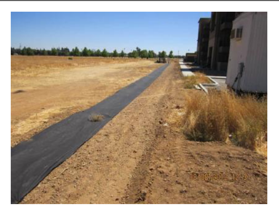
Photograph 1. View looking east of northern perimeter of the construction site. Note that BMPs had not been installed for perimeter control.