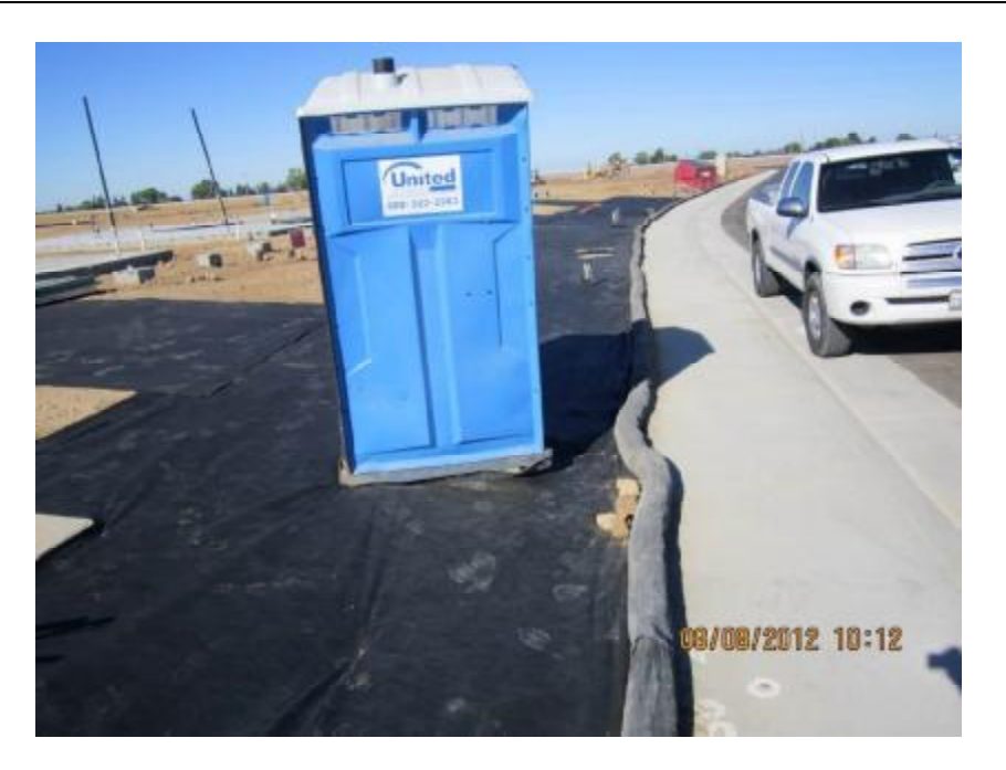
Photograph 3. View of portable toilet at the site which was not staked into the ground or otherwise secured.