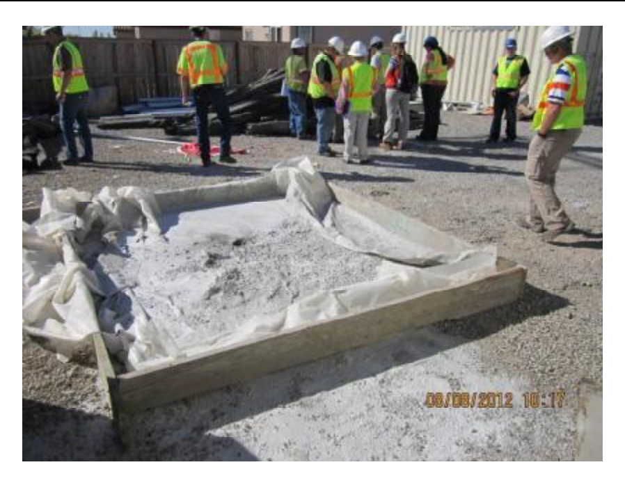
Photograph 5. View of concrete washout area at the site. Note concrete waste material located adjacent to the washout containment structure.