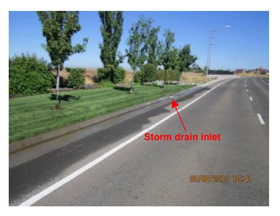
Photograph 5. View of turf area along roadway upgradient of outfall. Note evidence of irrigation flows to the curb and gutter.