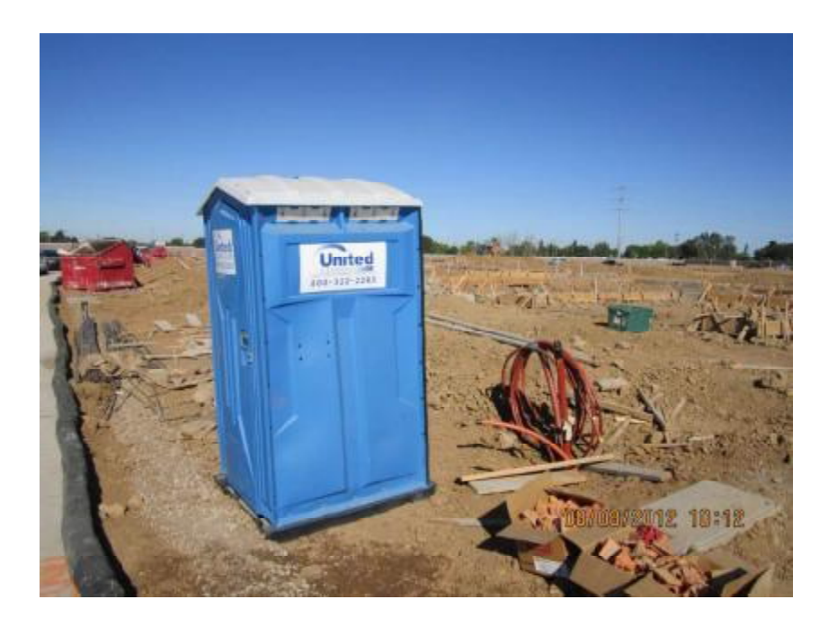
Photograph 4. View of an additional portable toilet at the site which was not staked into the ground or otherwise secured.