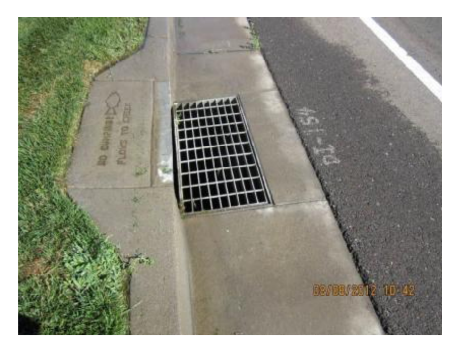
Photograph 6. Close-up view of storm drain inlet noted in Photograph 5. Note wetted area surrounding inlet.