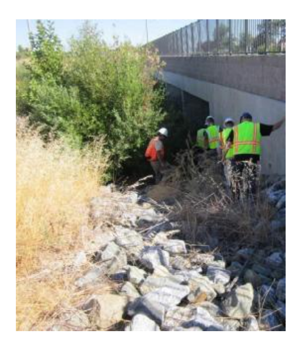
Photograph 1. View of access route to outfall.