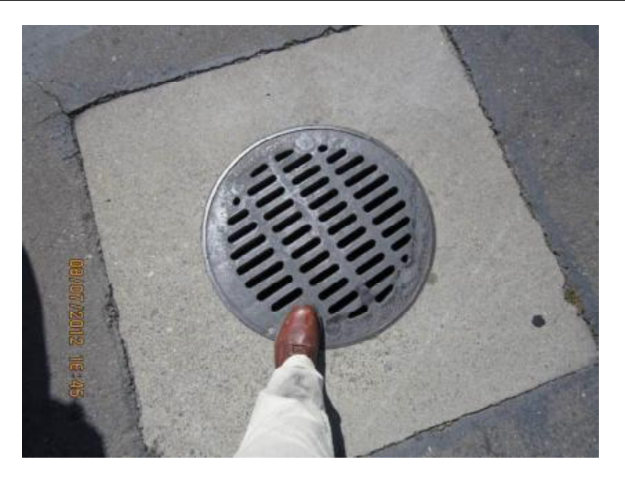
Photograph 11. View of storm drain inlet without BMPs for inlet protection.