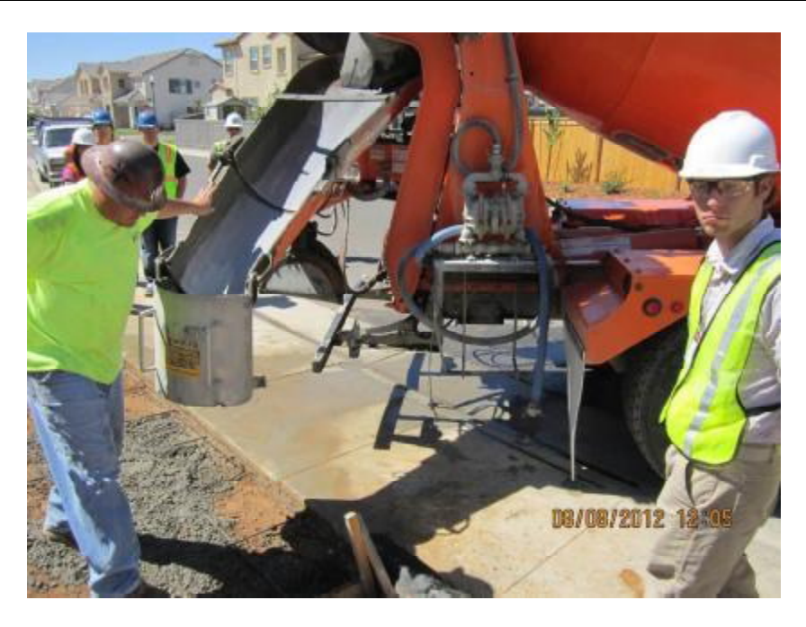
Photograph 5. View of contractor demonstrating how the "self-contained" cleaning procedure functioned on his concrete truck.