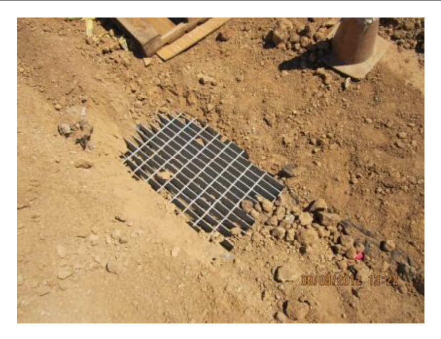
Photograph 7. Laguna Corporate Center Construction Project – Close-up view of storm drain inlet shown in Photograph 6.