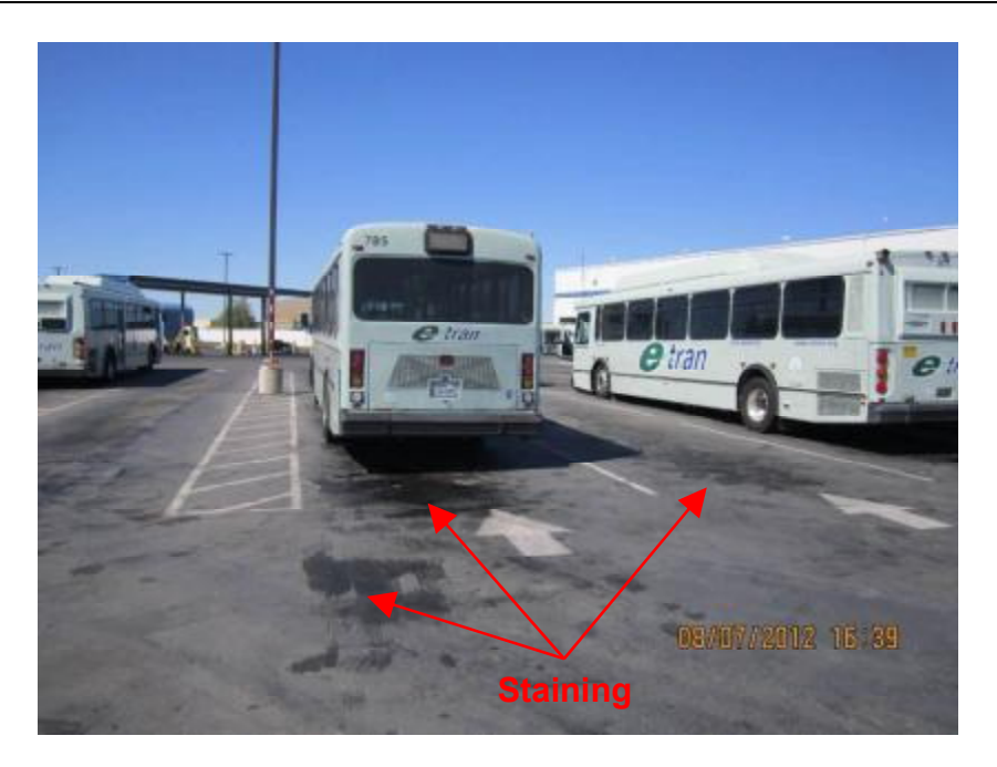
Photograph 9. Example of staining on impervious ground surface in bus storage and parking area.