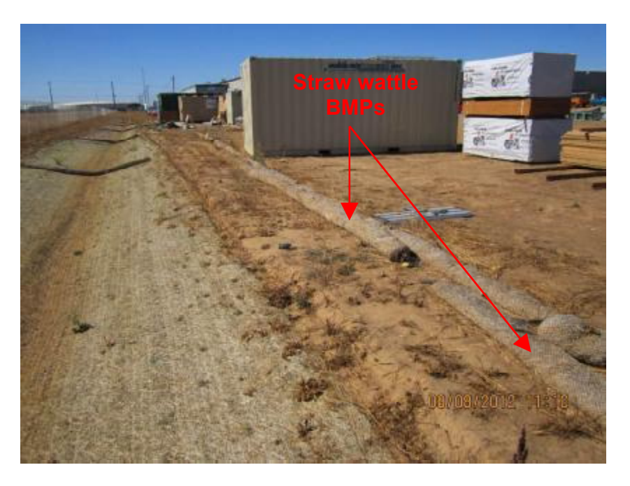
Photograph 3. View of straw wattle BMPs installed along the eastern edge of the site. Note that the straw wattles were not entrenched into the ground.