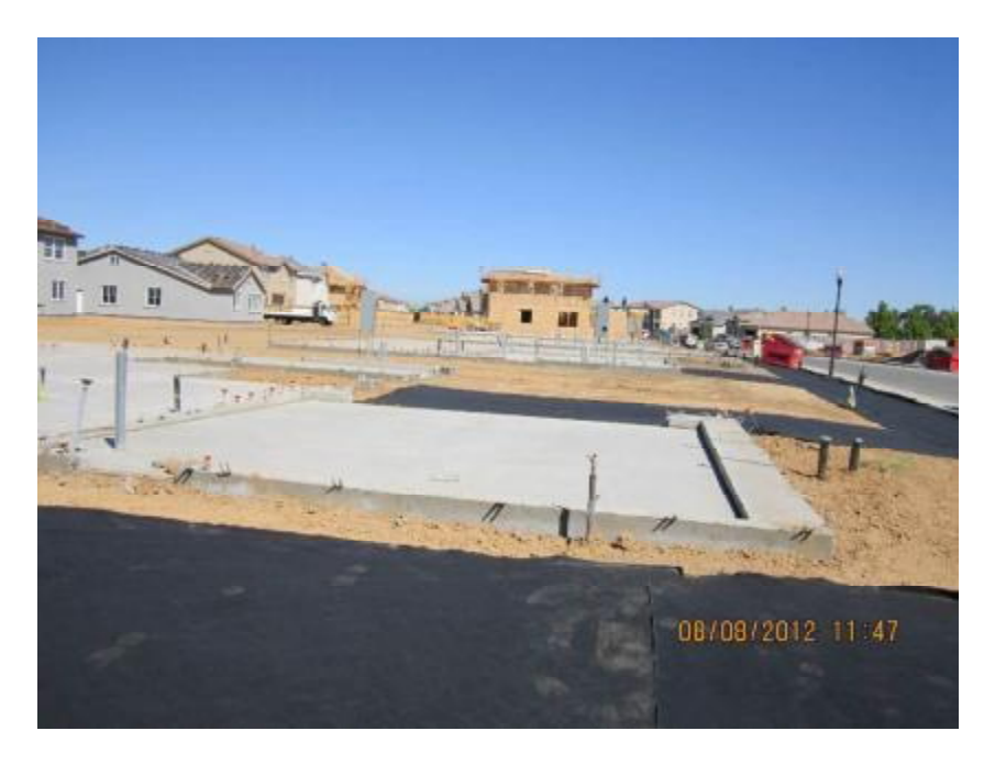
Photograph 1. View of lots with geotextile fabric applied around the perimeter of an active lot.