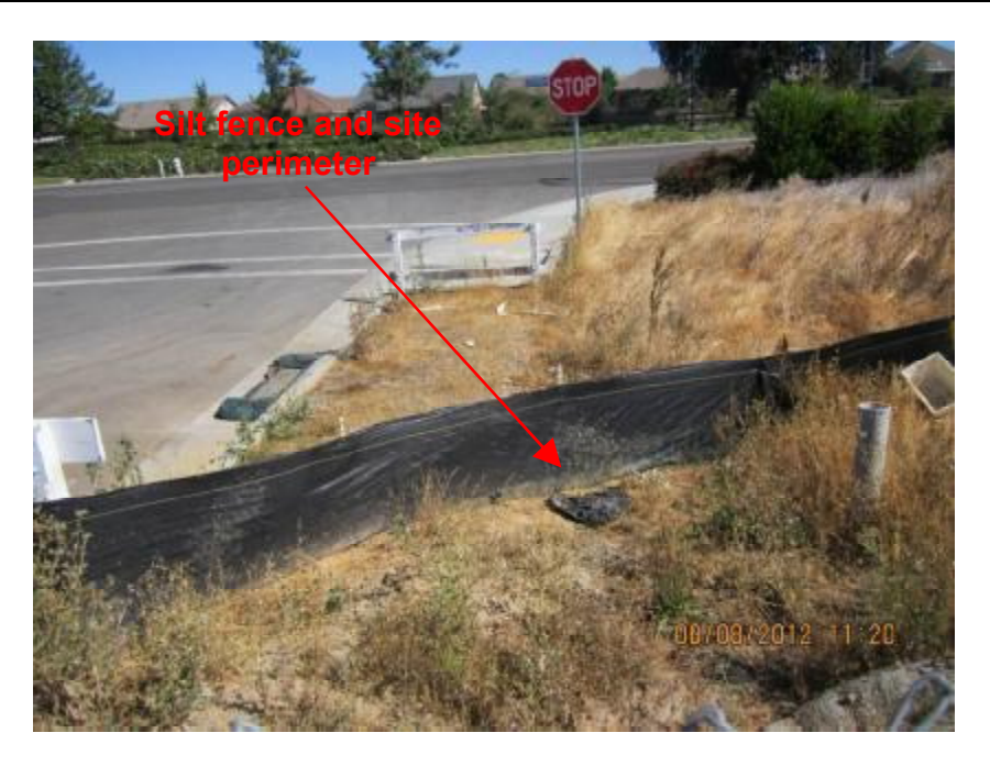
Photograph 7. View of silt fence BMP installed downgradient of the straw wattles shown in Photographs 5 and 6.