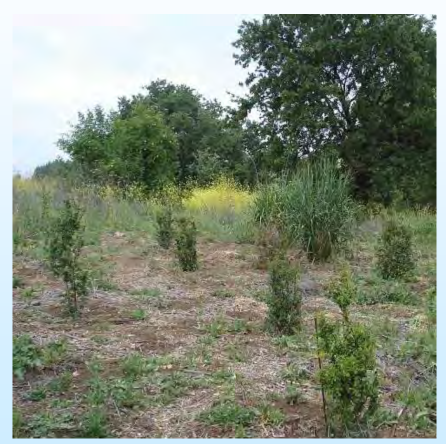
Santa Monica Mountains Conservancy native plant restoration along riparian corridors

returning natural functions to a degraded aquatic resource