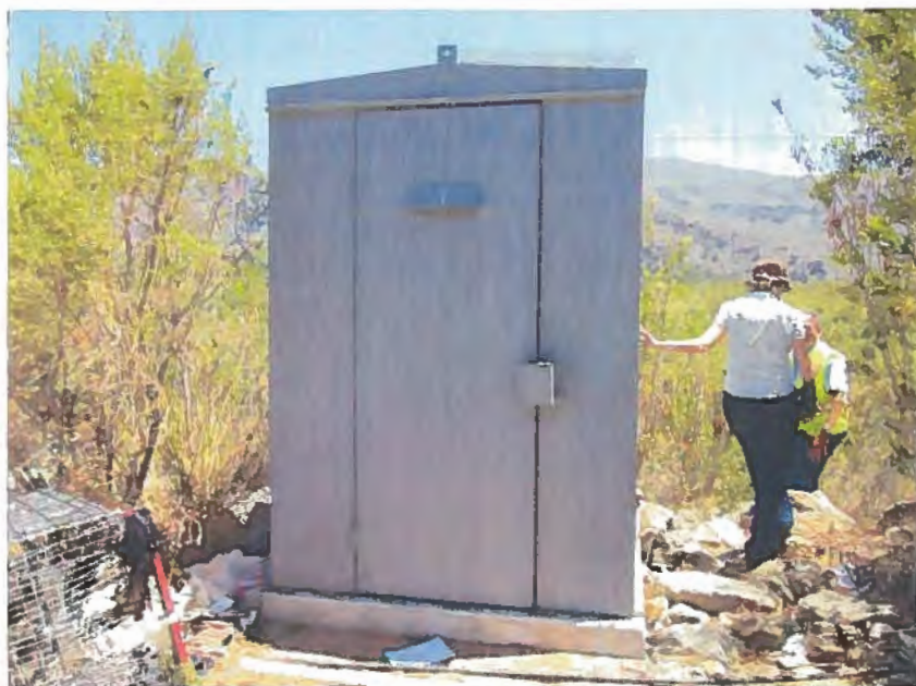
Photograph 3. City Monitoring Outfall – View of VCWPD monitoring box located north of the City Monitoring Outfall.