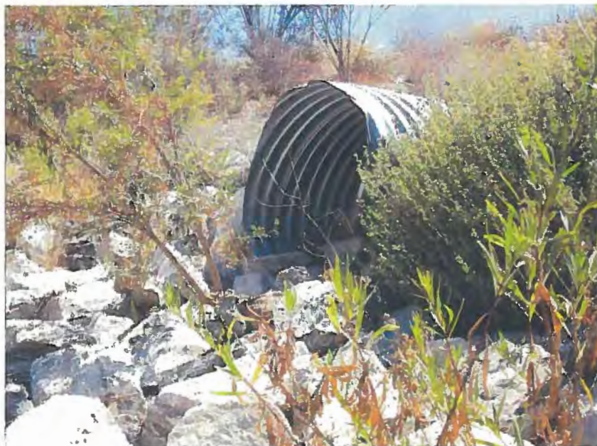
Photograph 2. City MS4 Outfall East of Ojai Road – Closer view of the outfall shown in Photograph 1. The outfall was dry and the outfall pipe was clean of debris and sediment at the time of the site visit.