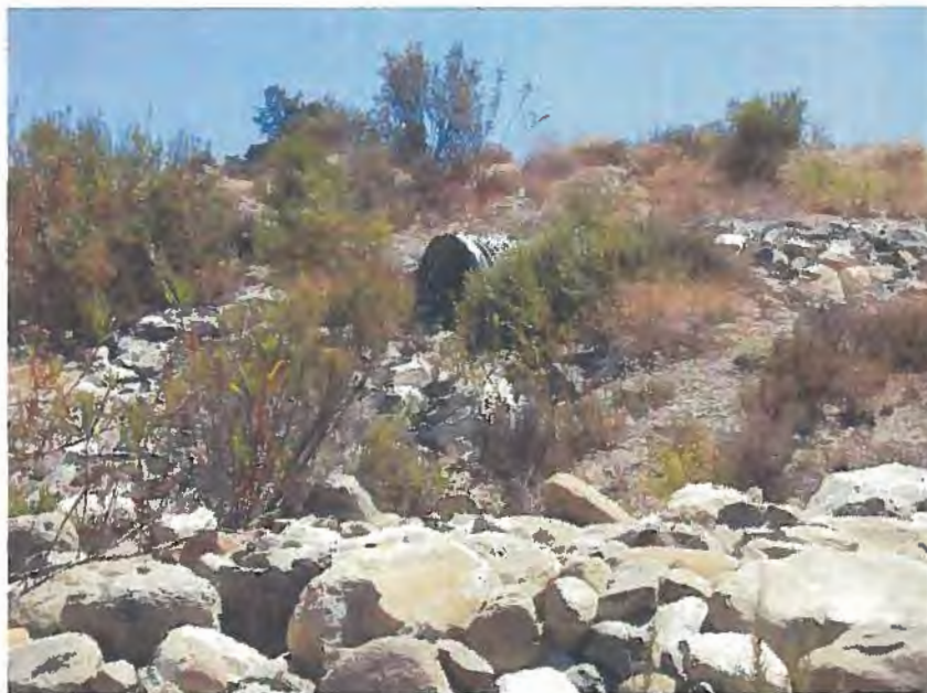
Photograph 1. City MS4 Outfall East of Ojai Road – View of the 54-inch CMP outfall.