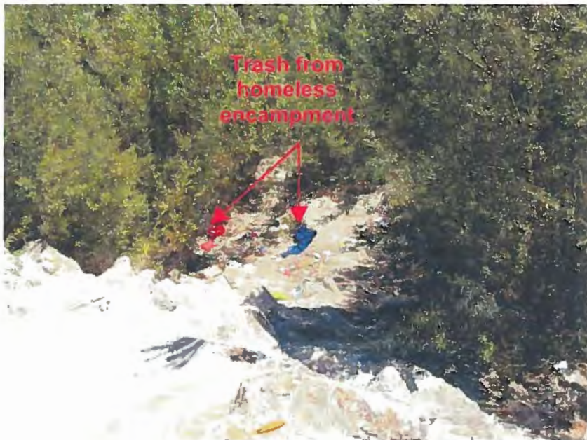
Photograph 2. City Monitoring Outfall – View of trash associated with the homeless encampment located directly below the City Monitoring Outfall to the south.