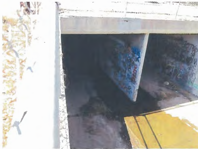
Photograph 1. City MS4 Outfall to VCWPD MS4 – View of the two large concrete box culverts through which discharges from the City MS4 would enter a channel owned and operated by the VCWPD.