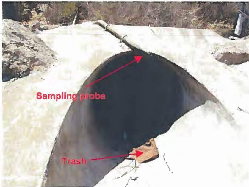
Photograph 1. City Monitoring Outfall – View of the 36-inch diameter culvert outfall. Note the sampling probe which had been installed at the outfall and trash within the outfall.