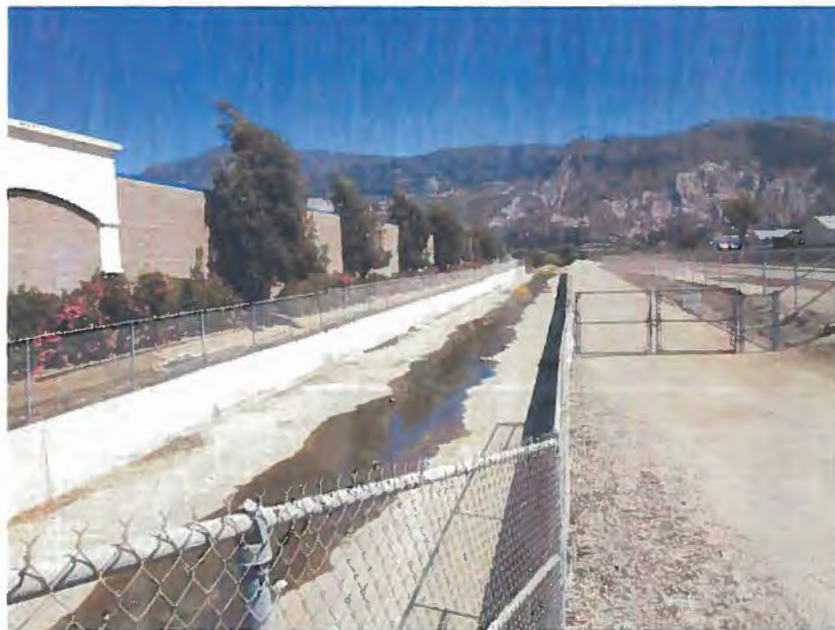
Photograph 2. City MS4 Outfall to VCWPD MS4 – View of VCWPD channel looking south from the box culverts shown in Photograph 1. Note that water was flowing in the channel at the time of the site visit.