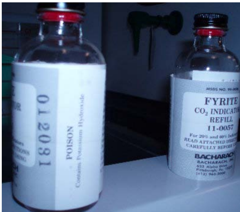
Photo 19: unlabeled bottles of discarded potassium hydroxide in the Wiencke Lab