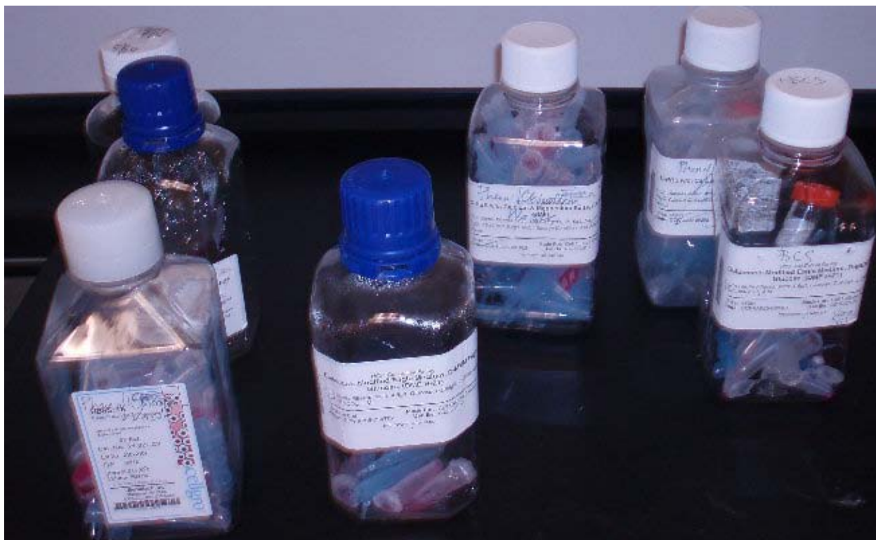
Photo 18: six unlabeled bottles of waste phenol chloroform in the Long-Cheng Li Lab