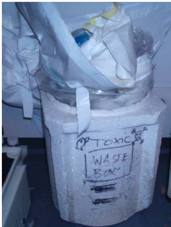
Photo 7: open, unlabeled, overflowing styrofoam hazardous waste container