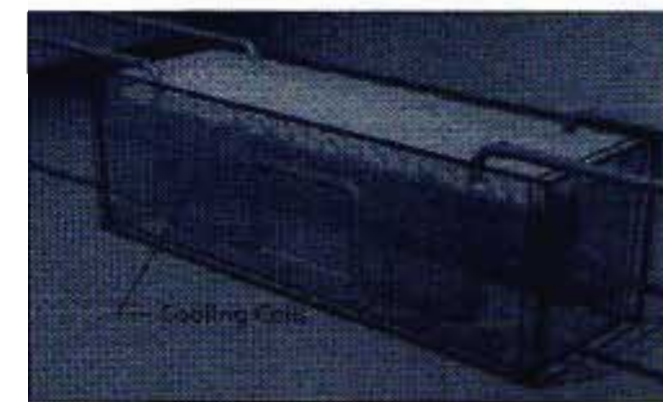
Figure 1: An Internal Cooling System

To maintain plating solutions that are well mixed and at the correct temperatures without the use of air bubblers, most facilities have opted to install cooling coils on the interior walls of their plating tanks. Figure 1 shows an internal cooling system of this type. However, internal cooling systems have drawbacks. For example, slower plating rates, increased downtime, and higher reject rates have been experienced after installing such systems. Parts are considered rejects by the electroplater if, after plating, they do not meet specifications because of discoloration, poor adhesion, roughness, lack of hardness, or high porosity.