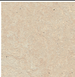
Lightly marbled texture