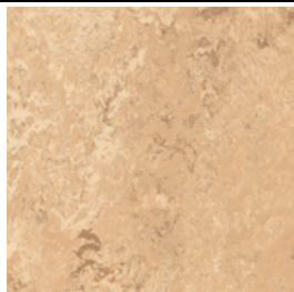
Vibrant colors with texture