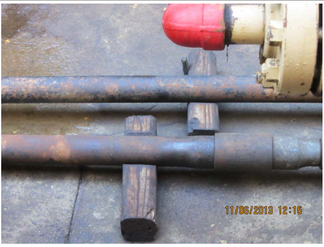
Photo No. 18 Time: 1115 Direction Photo Taken: W Photo Description: TEST LINES (AT LEFT) TO WELL #19 (IDLE) AND #19 WELL HEAD AT RIGHT

Photo No. 17 Time: 1115 Direction Photo Taken: S Photo Description: LUMBER USED AS PIPING SUPPORTS FOR WELL #19 TEST LINES (CURRENTLY IDLE)