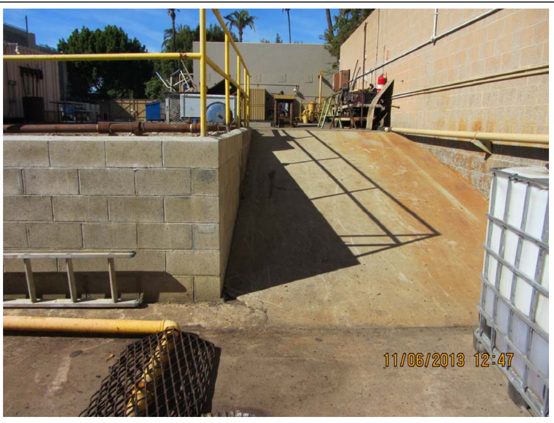
Photo No. 32 Time: 1149 Direction Photo Taken: S Photo Description: VIEW OF PAVEMENT IN AREA SHOWING EXCESSIVELY DARK IN GOOGLE MAP IMAGE – SEE END OF PHOTOLOG

Photo No. 31 Time: 1147 Direction Photo Taken: NW Photo Description: RAMP AT TANK FARM CONTAINMENT AREA; PIPING PROTECTED FROM VEHICLES BY METAL GUARDS