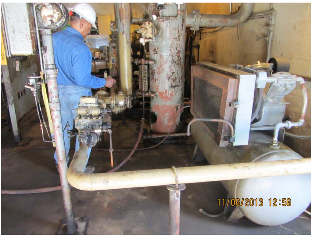
Photo No. 36 Time: 1201 Direction Photo Taken: N Photo Description: MICROTURBINES FOR GAS EXTRACTED AT FACILITY.

Photographer: WITUL Photo No. 35 Time: 1156 Direction Photo Taken: NE Photo Description: VAPOR RECOVERY UNIT AT REAR, COMPRESSOR AT RIGHT, AND PIPING - IN WATER INJECTION PUMP HOUSE.