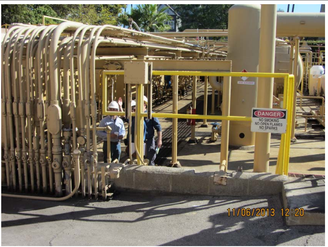
Photo No. 20 Time: 1121 Direction Photo Taken: NE Photo Description: TANK FARM CONTAINMENT AREA, SCRUBBER AT LEFT (IN PIT).

Photo No. 19 Time: 1120 Direction Photo Taken: E Photo Description: PHOTO OF TANK FARM CONTAINMENT AREA; VIEW INCLUDES LOCATION WHERE H2S DANGER SIGN HAD PREVIOUSLY BEEN ON RAILING