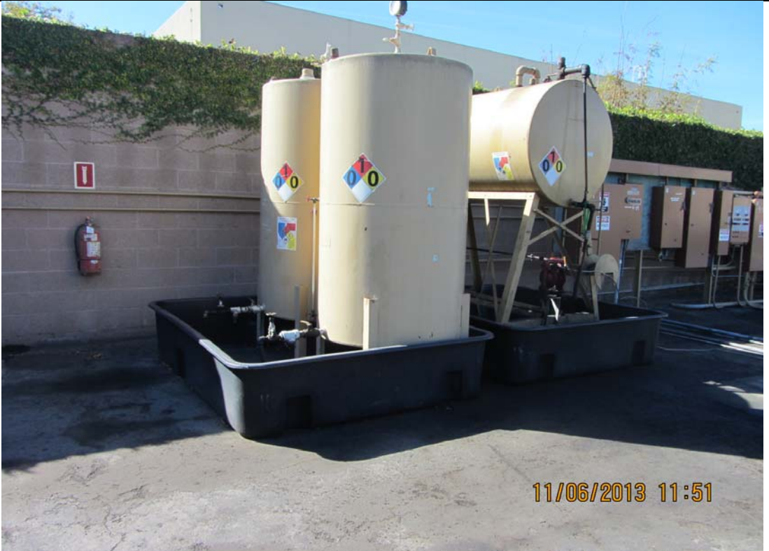
Photo No. 6 Time: 1051 Direction Photo Taken: S Photo Description: HYDRAULIC OIL TANKS IN SECONDRY CONTAINMENT – TANK AT RIGHT IN USE