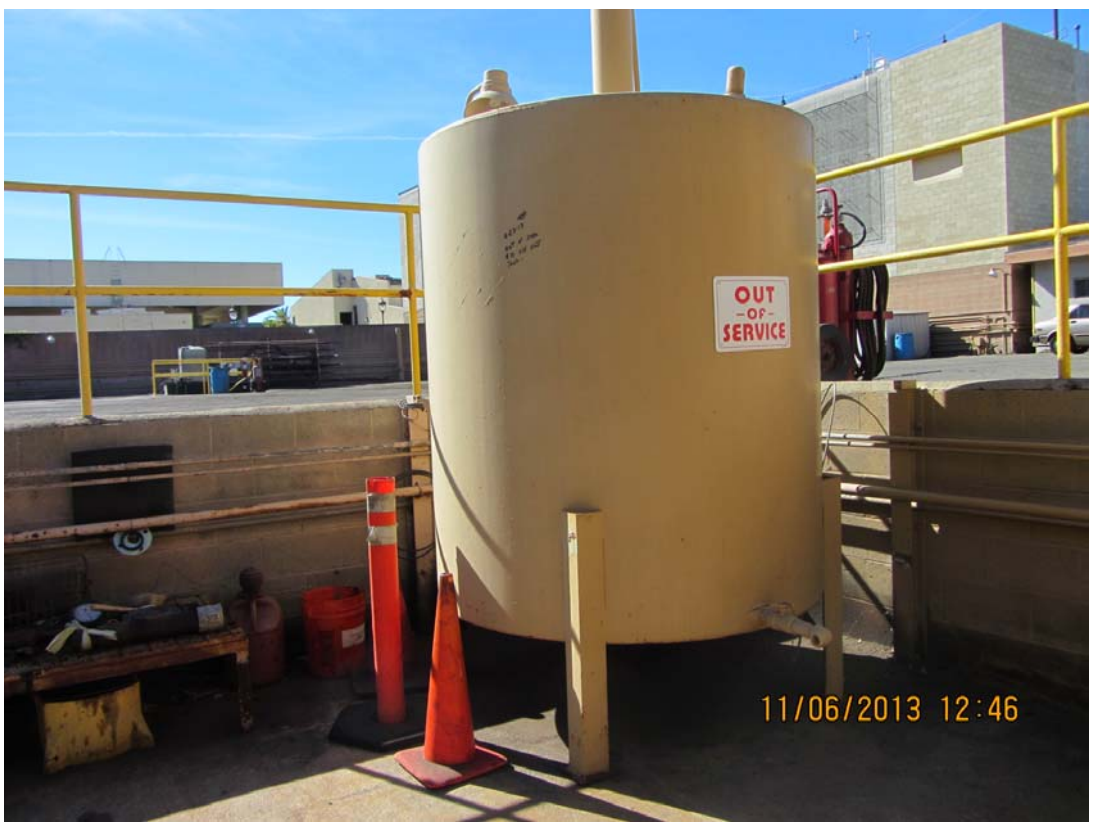
Photo No. 30 Time: 1146 Direction Photo Taken: N Photo Description: ORANGE-SCENTED SOLVENT TOTE IN TANK FARM CONTAINMENT AREA

Photo No. 29 Time: 1146 Direction Photo Taken: W Photo Description: #10 OLD VENT TANK LABELED OUT OF SERVICE, MARKED WITH OOS DATE OF 4/25/13