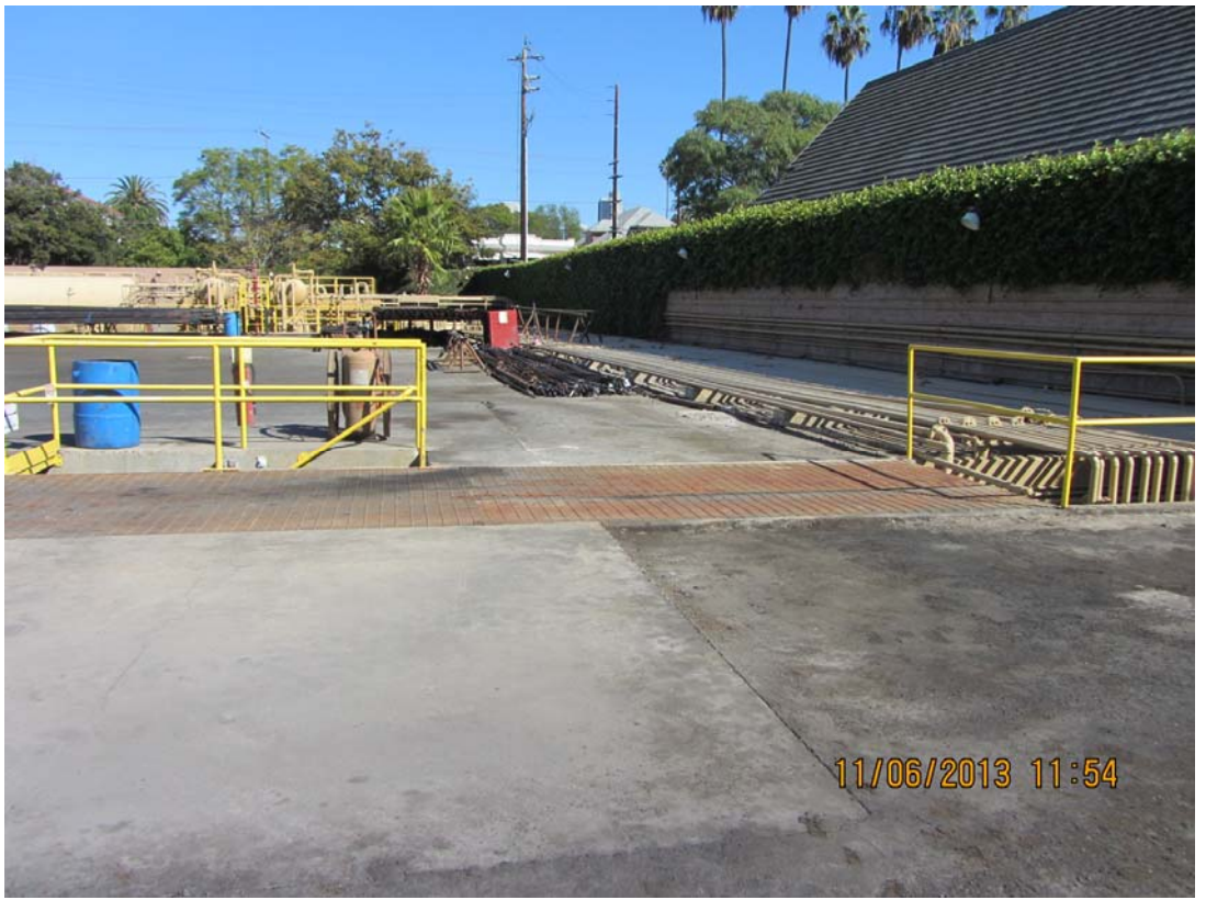
Photo No. 10 Time: 1100 Direction Photo Taken: WNW Photo Description: WELL GALLERY EAST ENTRANCE WITH H2S WARNING SIGN IN PLACE ON RAIL.

Photo No. 9 Time: 1054 Direction Photo Taken: NE Photo Description: WELL GALLERY EAST ENTRANCE AND TRANSFER PIPES AT RIGHT.