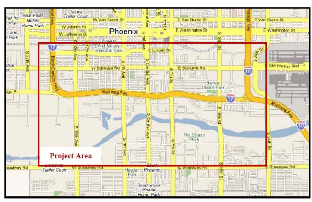
Figure 1. Project Area - Multimedia Toxics Reduction Project (MMTRP) and IC/GN

In June 2003, ADEQ formed a citizen advisory committee, the South Phoenix Community Action Council (CAC) to identify environmental issues of concern in their communities. A group comprised of EPA, ADEQ, Arizona Department of Health Services, Maricopa County Environmental Services Department, and the City of Phoenix, provided the CAC with an environmental profile of the South Phoenix area. The CAC then identified the geographic area for the project (see Figure 1) and determined the highest priorities for reducing toxic pollution.