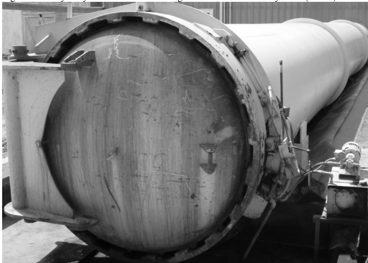
Figure 1. Heavy Duty Wood Preservative High Pressure Treatment Cylinder (Retort)

Again, due to the unique nature in which heavy duty wood preservatives are applied, wood preservative risk assessment requires a different approach than those used for standard agricultural or antimicrobial pesticides. For example, unlike agricultural pesticide handlers who may be exposed to pesticides when mixing/loading, applying, or re-entering an area treated with