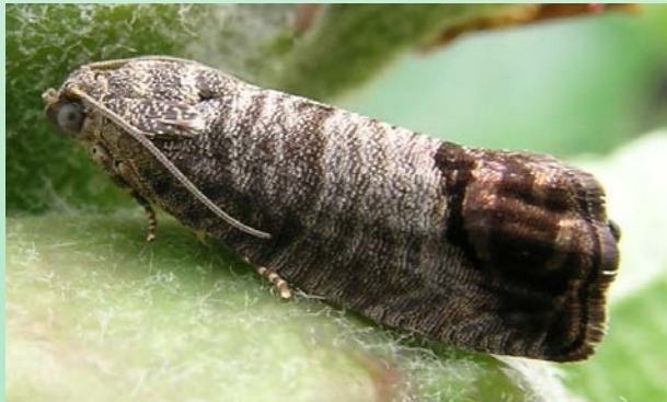
Codling moth adult

Northwest Horticultural Council Yakima, WA