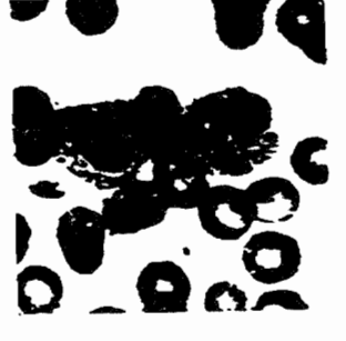
Fig. 4-8. Neutrophils in Pelger-Huet anomaly.

once in 51 cells, although in one female dog the sex lobe was present in 1 out of every 15 neutrophils and in another female in only 1 cell out of 95.