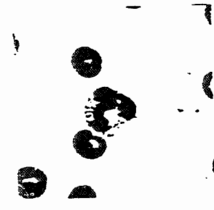
Fig. 4-5. Sex chromatin or "drumstick" lobe in a neutrophil of a female.