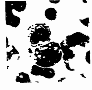
Fig. 4-7. Eosinophils in Pelger-Huet anomaly.