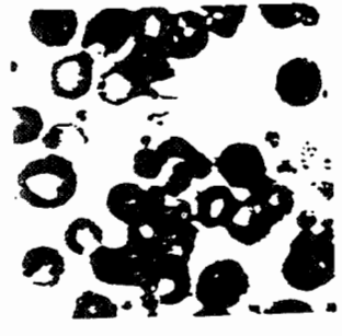
Fig. 4-6. Sessile nodules on the nucleus of a neutrophil of a male.