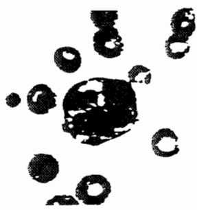
Fig. 4-3. Degenerating monocyte in old blood.