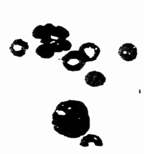
Fig. 4-4. Degenerating lymphocyte and neutrophil in old blood.