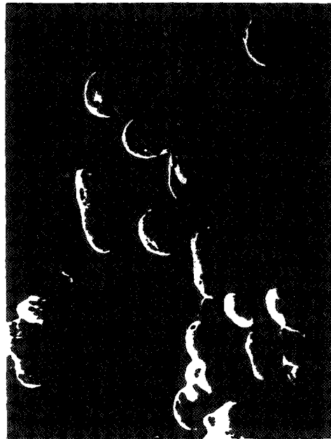
Fig. 4-9. Scanning electron photomicrograph of canine platelets. x 5,600.

The normal range of platelet count in the dog is 200,000-500,000/µl of blood. Venous blood has relatively less numerous platelets than the arterial blood, respective counts being 468,000 and 550,000/µl (Toxantina, 1938). In young beagle dogs, platelet counts are lower (280,000/µl at 6 months) than in adults (446,000/µl at 4 years) (Andersen, and Gee, 1958). In another study on beagle dogs, the average platelet count was found to be 400,000/µl at 18 months of age and 300,000/