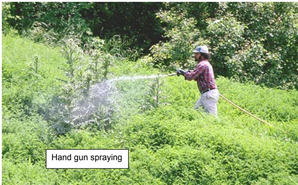
Hand gun spraying

the truck or drag the hose from the spray vehicle to the treatment area. The length of the hose can range from 500 to 2000 feet and the handgun has an effective spraying distance of 15 to 30 feet.