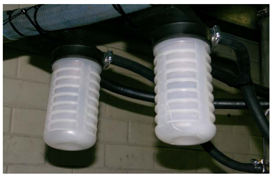
Figure 1-1. NCI Condensator on the Cummins N-14 Test Engine

According to NCI, crankcase exhaust comes in contact with silica bead separators in the Condensator, resulting in a molecular separation process where large, heavier oil molecules condense and collect in the Condensator containers. Water and acid present with the oil will also drop into the containers. Gaseous emissions, including hydrocarbons, continue through the system and are vented back into the engine air intake. Waste oil and condensate collected in the Condensator containers should be emptied during vehicle oil changes. This is done by unscrewing the container from the head and properly disposing of the waste. The separators are cleaned periodically in a solvent to dislodge and remove any carbon or sludge that may have attached to the silica beads. NCI states that this technology can provide the following benefits: