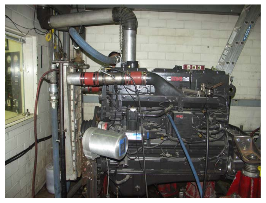
Figure 1-2. The Cummins N-14 Test Engine in the Dynamometer Test Cell

The diesel engine used in the test program was a Cummins N-14 370-HP turbocharged engine manufactured in 1996 (Figure 1-2). This engine was selected for testing because it represents a large segment of heavy-duty diesel engines currently on the road for which the Condensator technology is intended. Prior to the start of testing (January 21, 2005), a Cummins technician inspected the engine in the test cell and verified that the engine was without mechanical problems and operating within its acceptable range of specifications.