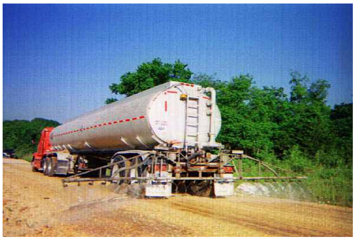
Figure 2. Application of DustGard product at FLW

The same driver and truck applied the product each time at FLW. Treatment of the 270-m (900-ft) road segment required approximately 0.5 man-hour, when allowances are made for placing and collecting the sampling pans. Figure 2 shows application of DustGard product at FLW.