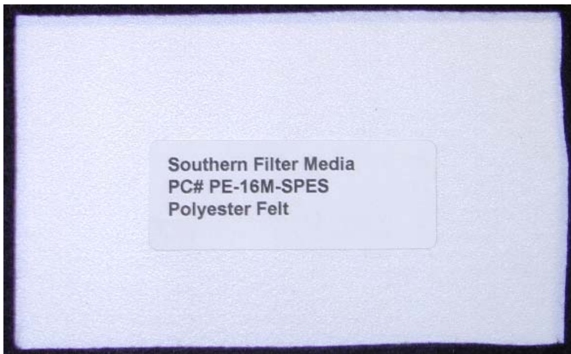
Figure 1. Photograph of Southern Filter Media, LLC's PE-16/M-SPES filter fabric