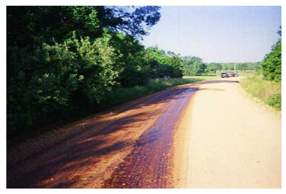
Figure 3. Application of EK35 product at FLW \,