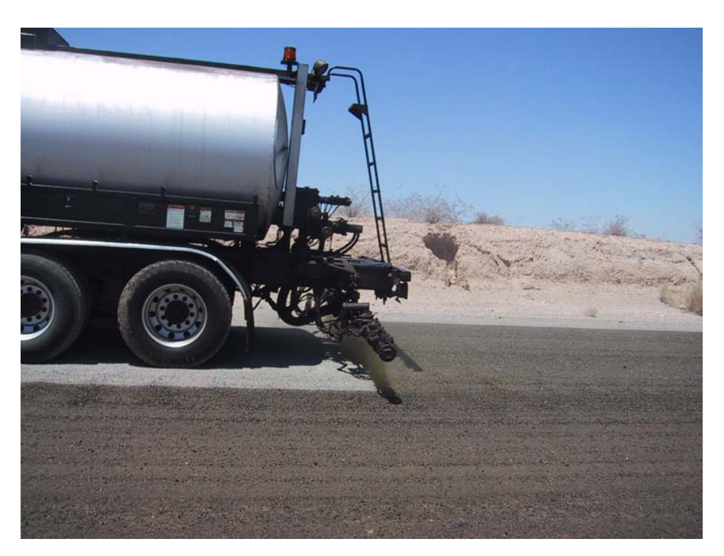
Figure 4. Application of EK35 product at MC