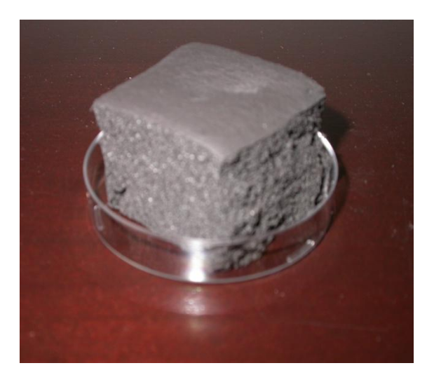
Figure S-1. Top (outer) surface of material

Figures 2-1 and 2-2 show the top and bottom surfaces of the material.