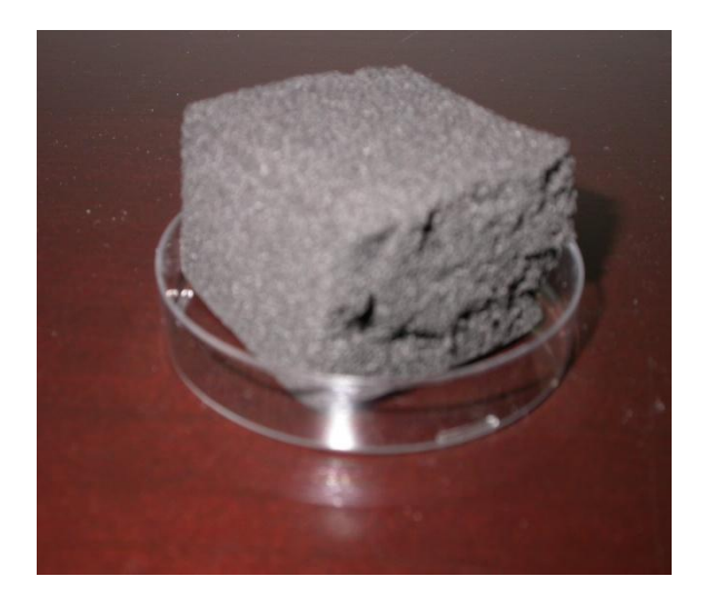
Figure S-2. Bottom (inner) surface of material