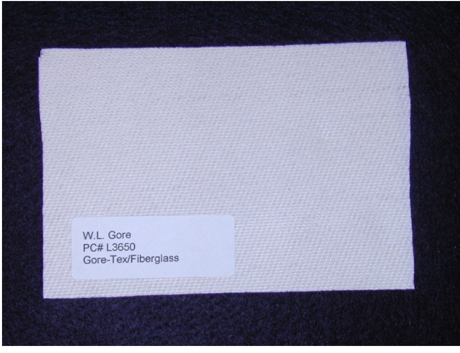
Figure 1. Photograph of W. L. Gore & Associates, Inc.'s L3650 filter fabric