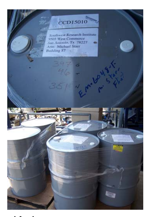
Figure 1. Sealed drums of Flint Hills Resources diesel fuels