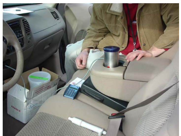
Figure 6-2. PharmaLeads' Portable Incubator Operates Using a Car Auxiliary Power Outlet and Fits into a Cup Holder