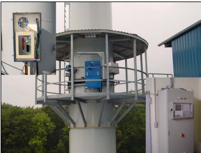
Figure 2-1. Photograph of AMESA

The titanium probe is used for both the isokinetic sampling and cooling of the hot flue gas to less than 50°C. The cooled flue gas, together with any accumulated condensate, is fed into the cartridge filled with adsorption resin (XAD-2) via an upstream quartz wool filter.