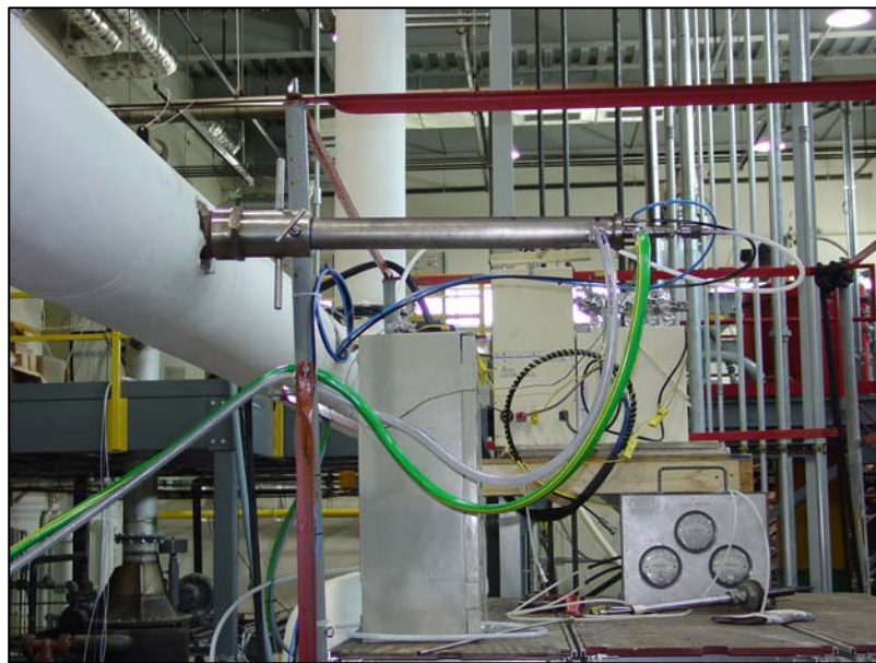
Figure 3-3. Installation of AMESA Sampling Probe

Figure 3-3 shows the installation of the AMESA sampling unit on the duct. Since the diameter of the exhaust duct was considerably smaller than normal full-scale applications, the installation of the AMESA probe was modified from the normal configuration. The modified installation required a section of unheated Teflon tubing (approximately 1 meter in length) to deliver the sample gas from the exit of the probe to the sampling media. Because of the potential for loss of