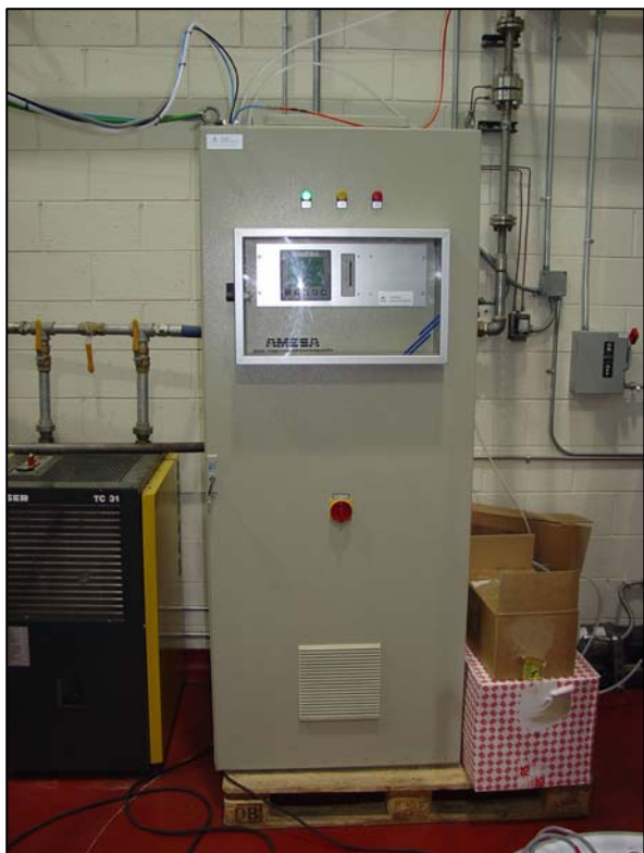
Figure 3-4. AMESA Control Unit

Immediately prior to each test run, a sampling cartridge was installed in the AMESA sampling unit and an empty data card was installed in the control unit. During the verification test, the AMESA system was manually started and stopped for each test run, although the AMESA allows for automated operation. After completion of each test run, the sampling cartridge, probe liner, and tubing leading from the probe to the sampling unit were removed. The probe liner and tubing were rinsed with methylene chloride and then with toluene. The rinsate and sampling cartridges were stored in a freezer until transport to their respective laboratories for analysis.