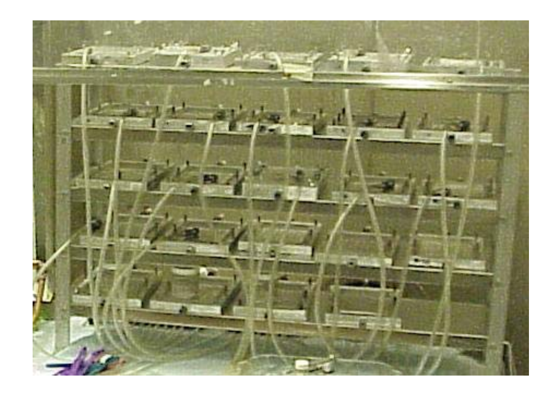
Figure 5-3. Offgas Rack