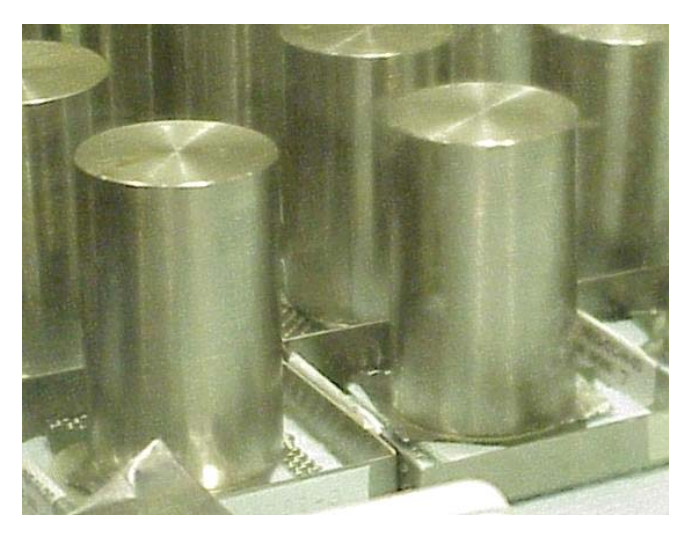
Figure 5-2. Contact Transfer Weights

5.4.1.1 Contact Transfer Equipment. The contact transfer test equipment will include 2-in diameter pieces of latex dental dam for contact transfer measurements, and 1-in diameter weights (65 g/cm<sup>2</sup>) for placing on the latex. Figure 5-2 shows the contact transfer test with the weights applied to the test coupons. The latex will be washed with water and dried at 185°F for 24 hours prior to cutting.