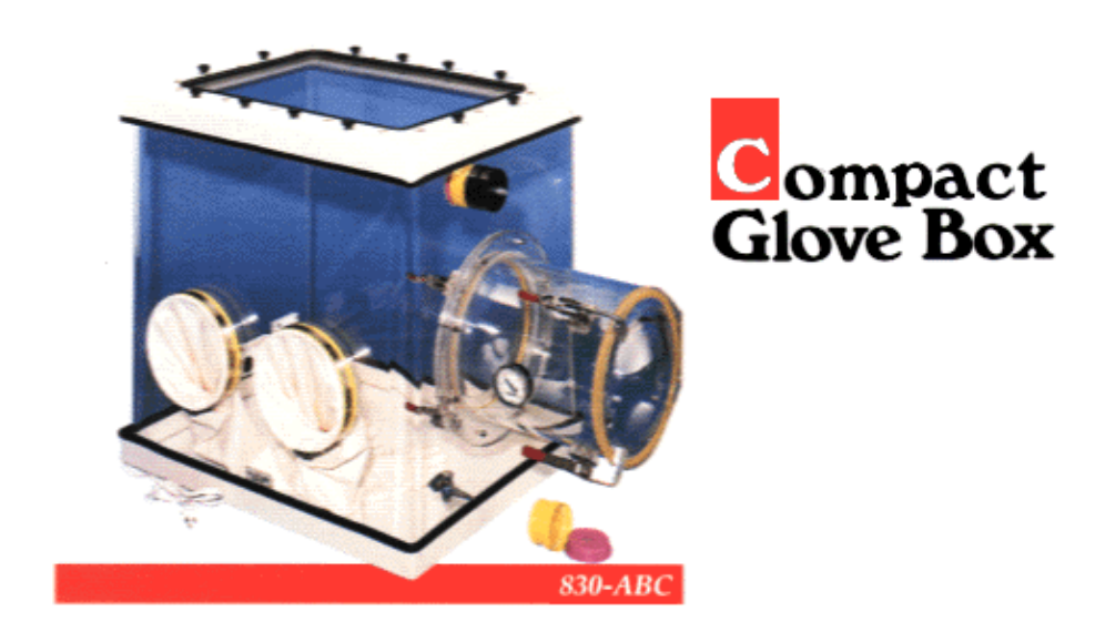
Figure 5-1. Compact Glove Box—BW Agent Tests

A decontaminant exposure chamber will be used to expose the test coupons to the decontaminant. For biological agent testing, a Compact Glove Box Model 830-ABC (Plas Labs, Inc., Lansing, MI; Figure 5-1) will be used. This unit has inner dimensions of 28"w x 23"d x 29"h (71 cm x 59 cm x 74 cm) and outer dimensions of 43"w x 24"d x 31"h (110 cm x 61 cm x 79 cm). The unit also has a top opening of 17" x 23" (43 cm x 58 cm) and a transfer chamber that is 12" (30 cm) long and an inner diameter of 11" (28 cm). The chamber has a total volume of 11.2 cu ft (317 L). A set of glove ports, located on the side, are available for working in the hood. The same type of glove box, but without the transfer chamber, will be used in the chemical agent testing. In both cases, the decontaminant will be directed from the vendor's delivery system through the exposure chamber, at the temperature and humidity conditions established by the delivery system.