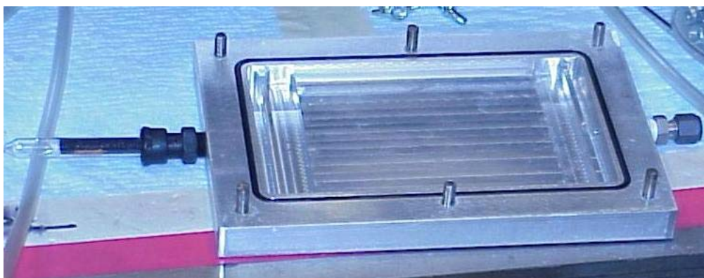
Figure 5-4. Offgas Cell