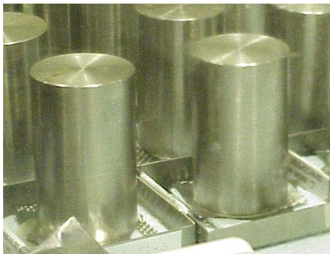
Figure 5-2. Contact Transfer Weights

5.4.1.1 Contact Transfer Equipment. The contact transfer test equipment will include 2-in diameter pieces of latex dental dam for contact transfer measurements, and 1-in diameter weights (65 g/cm 2 ) for placing on the latex. Figure 5-2 shows the contact transfer test with the weights applied to the test coupons. The latex will be washed with water and dried at 185°F for 24 hours prior to cutting.