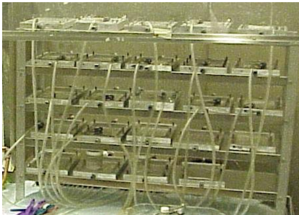
Figure 5-3. Offgas Rack