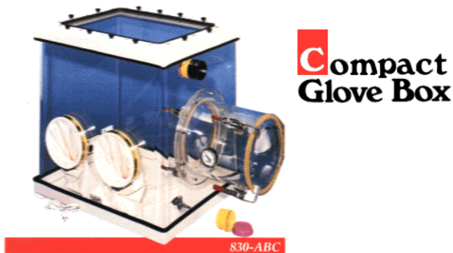
Figure 5-1. Compact Glove Box—BW Agent Tests

A decontaminant exposure chamber will be used to expose the test coupons to the decontaminant. For biological agent testing, a Compact Glove Box Model 830-ABC (Plas Labs, Inc., Lansing, MI; Figure 5-1) will be used. This unit has inner dimensions of 28"w x 23"d x 29"h (71 cm x 59 cm x 74 cm) and outer dimensions of 43"w x 24"d x 31"h (110 cm x 61 cm x 79 cm). The unit also has a top opening of 17" x 23" (43 cm x 58 cm) and a transfer chamber that is 12" (30 cm) long and an inner diameter of 11" (28 cm). The chamber has a total volume of 11.2 cu ft (317 L). A set of glove ports, located on the side, are available for working in the hood. The same type of glove box, but without the transfer chamber, will be used in the chemical agent testing. In both cases, the decontaminant will be directed from the vendor's delivery system through the exposure chamber, at the temperature and humidity conditions established by the delivery system.