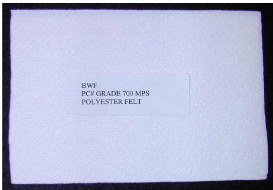
Figure 1. Photograph of BWF America, Inc.'s Grade 700 MPS Polyester Felt filter fabric