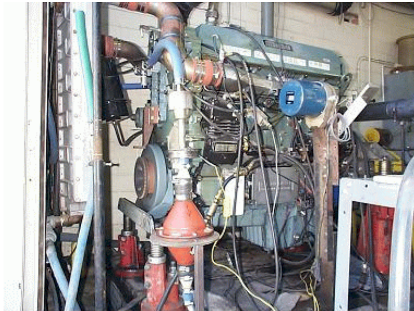
Figure 1. Baseline engine: a 1998 Detroit Diesel Corporation heavy-duty diesel engine, mounted in Southwest Research Institute's engine test cell #4.