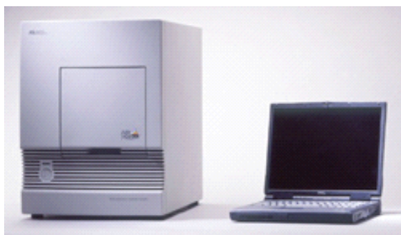
Figure 2-1. Applied Biosystems' ABI Prism ® 7000 Sequence Detection System

The TaqMan ® E. coli O157:H7 Detection Kit is part of an integrated system that includes polymerase chain reaction (PCR) chemistry, instrumentation, and data analysis software. Each TaqMan ® Detection Kit contains TaqMan ® probes and primers in the PCR mix along with MgCl 2 , dNTPs, and an internal positive control (IPC) system. The ABI Prism ® 7000 Sequence Detection System is a real-time PCR fluorescence detection instrument that combines a thermal cycler with an optical detection system. During amplification, it can distinguish between the fluorogenic labels for the assay target (i.e., E. coli O157:H7) and an IPC. The ABI Prism ® 7000 uses a microplate capable of running 96 samples. The PrepMan ™ Ultra Sample Preparation Reagent removes the inhibitory and interfering substances that potentially affect PCR amplification and lead to inconclusive results.